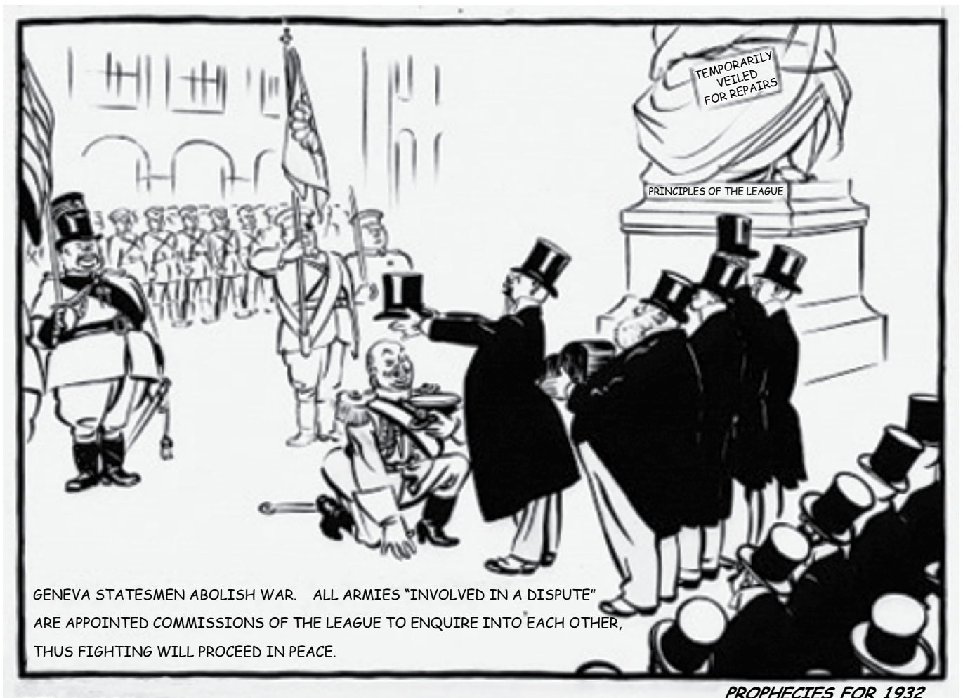
A British cartoon published in December 1931.