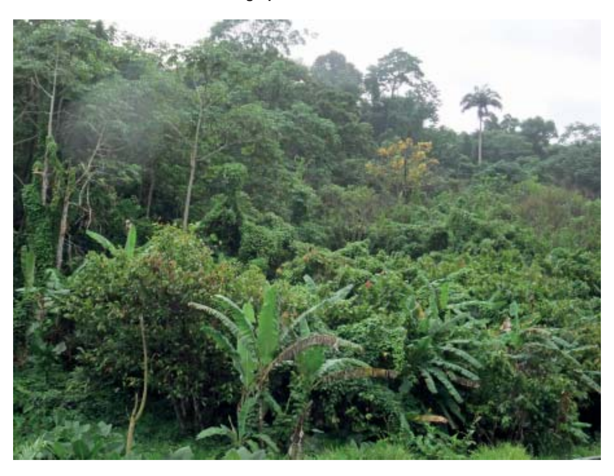
Photograph 3.1 for Question 3