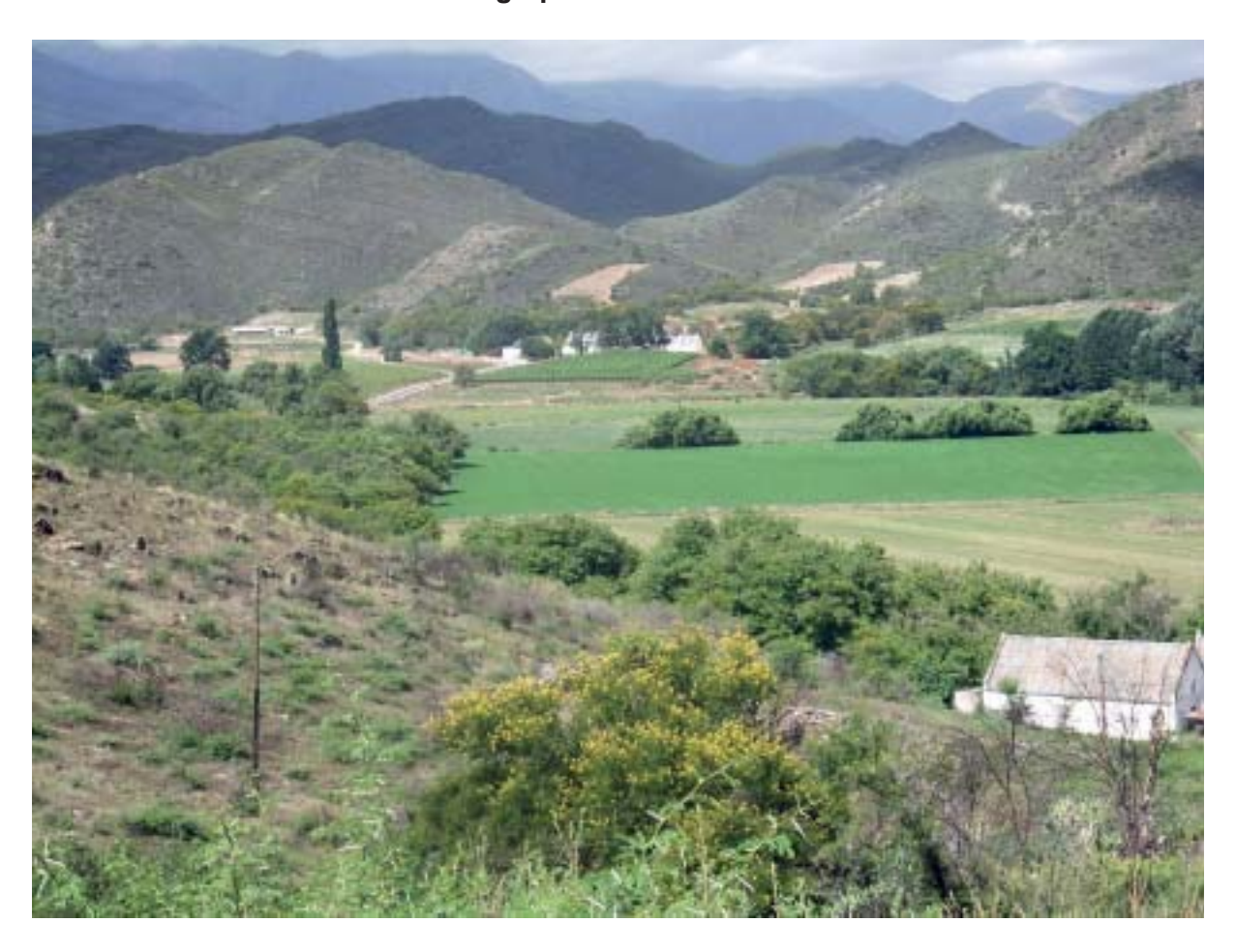
Photograph 6.1 for Question 6