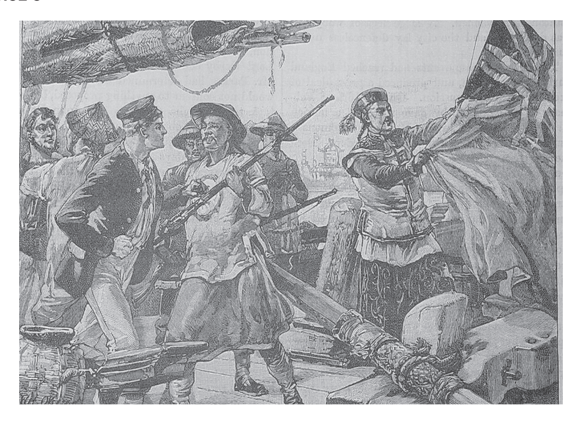
An illustration of events on the Arrow published in a British magazine in October 1856.