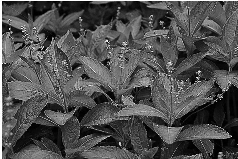
Magnification \times 1.0

3 The photograph below shows Mercurialis perennis , a plant found growing in woodland.