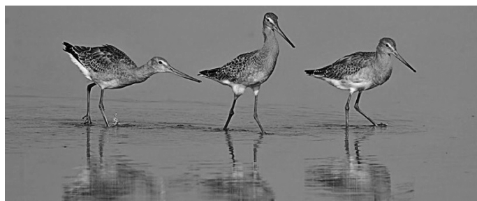
Magnification \times 0.05

These birds live in Iceland and have a lifespan of about 18 years.