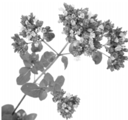
Magnification \times 1