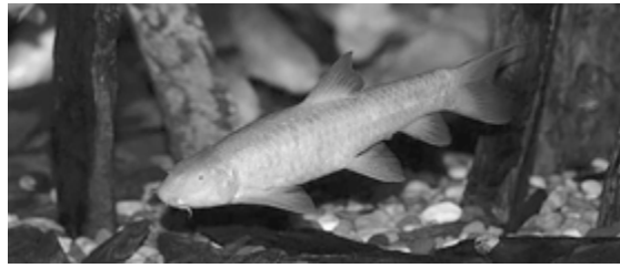
Magnification \times 1.5

2 The photograph below shows Garra barrimiae , a species of fish that feeds on aquatic plants.