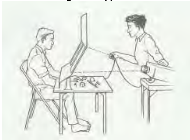
Diagram of apparatus

1 mark for each piece of equipment: one eye covered; gaze centred on fixation point; stimuli presented on 35mm transparencies for 1/10th of a second or less. Objects.