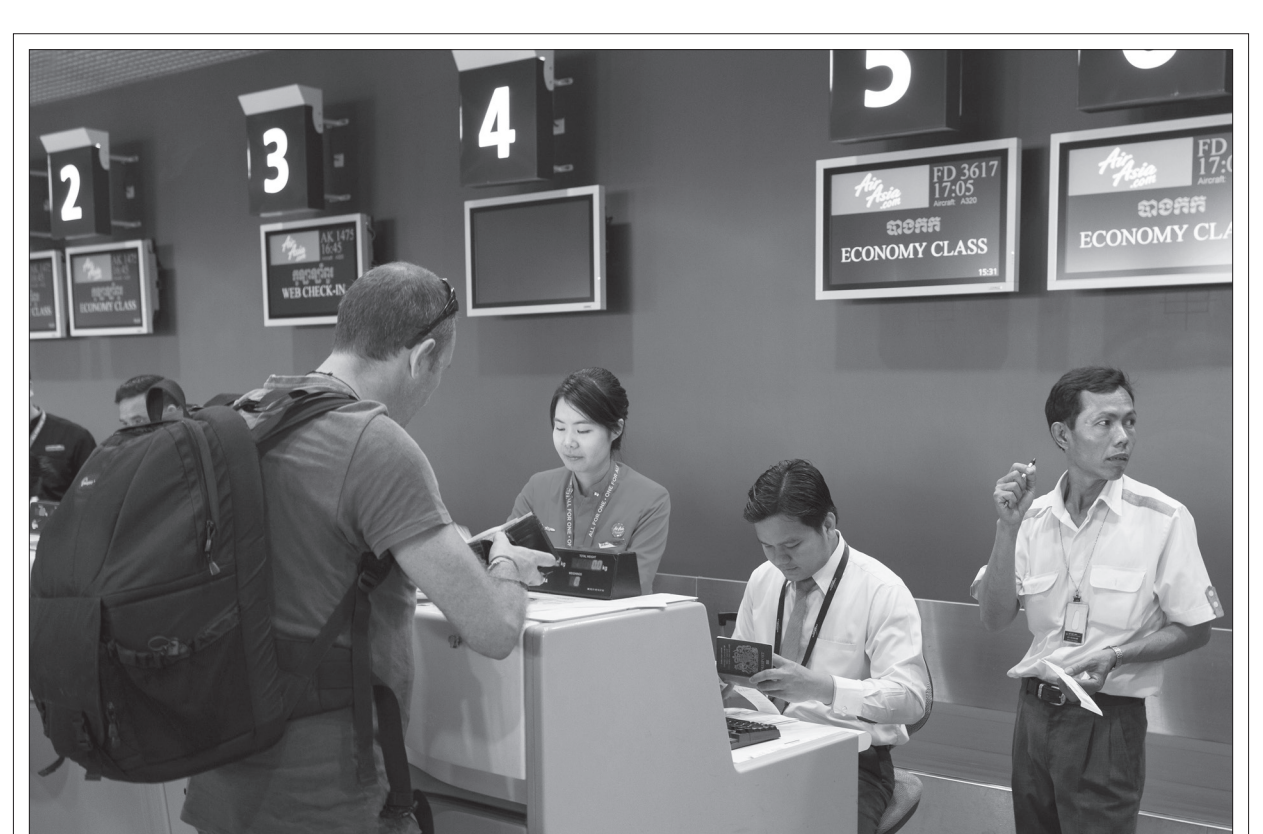
Fig. 2.1 for Question 2