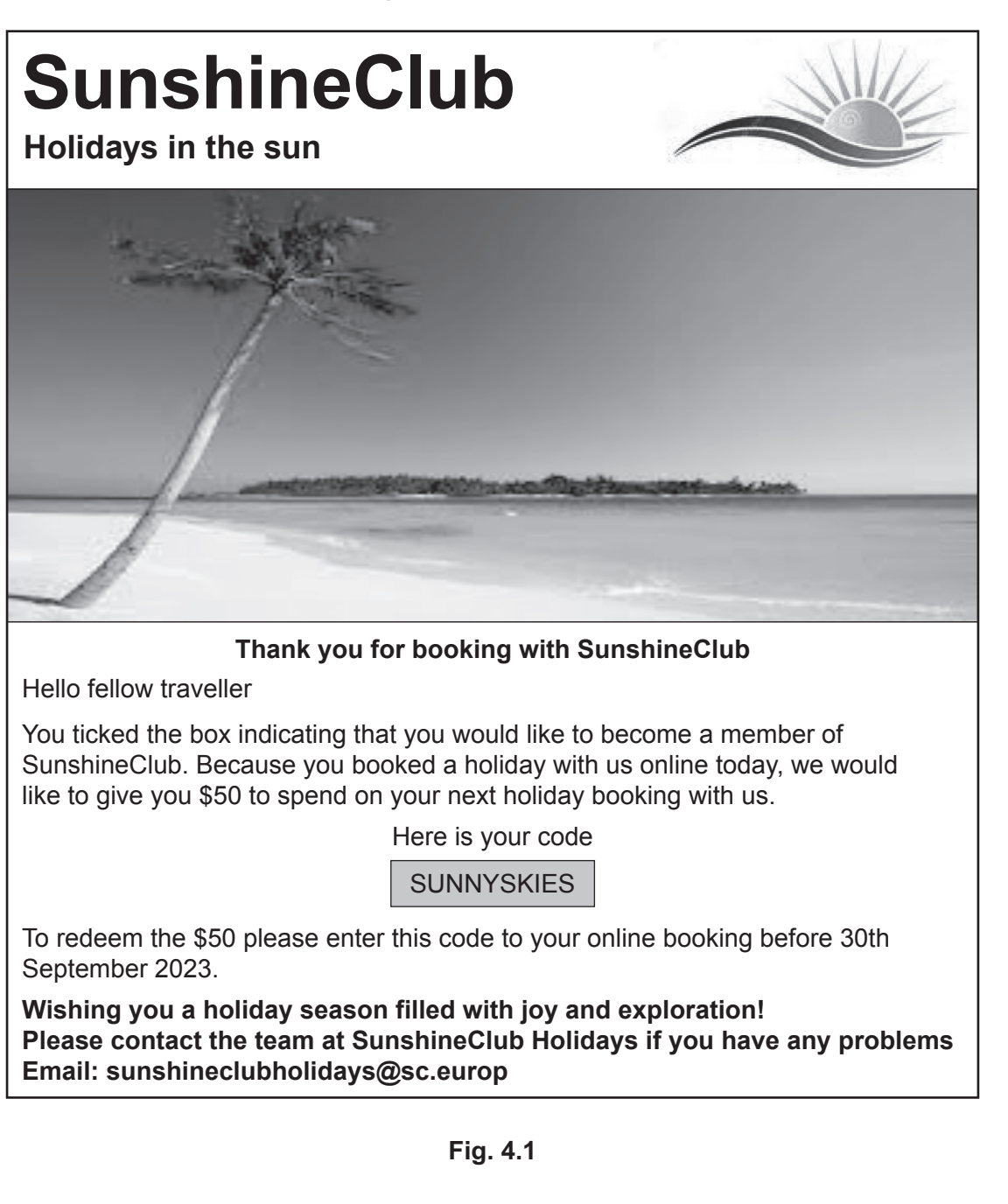
Fig. 4.1 for Question 4

The boundaries and names shown, the designations used and the presentation of material on any maps contained in this question paper/insert do not imply official endorsement or acceptance by Cambridge Assessment International Education concerning the legal status of any country, territory, or area or any of its authorities, or of the delimitation of its frontiers or boundaries.