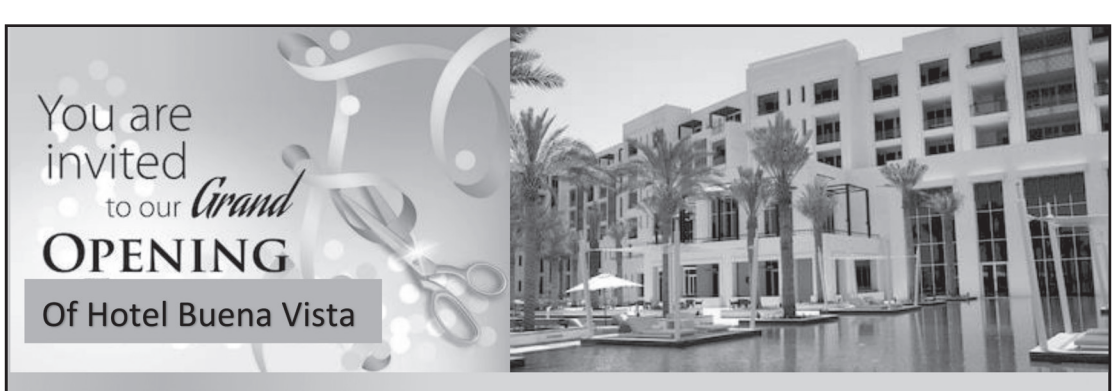
Fig. 1.1 for Question 1

On the beautiful island of Bora Bora, Hotel Buena Vista will be opening its doors on 20th June 2023.