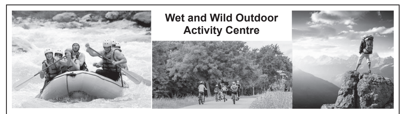
We specialise in educational groups, friends, families and singles

The forest, rivers and surrounding landscape of Wet and Wild Outdoor Activity Centre and Hotel are a playground for adventure seekers. Whether you are on an outdoor activity educational trip, a group of friends out for adventure or a family looking for a fun family activity holiday then look no further. From wild water rafting and rock climbing to a family bike ride around the countryside all will be provided at the Wet and Wild Outdoor Activity Centre. We arrange your transport, accommodation and insurance, so book your package today.