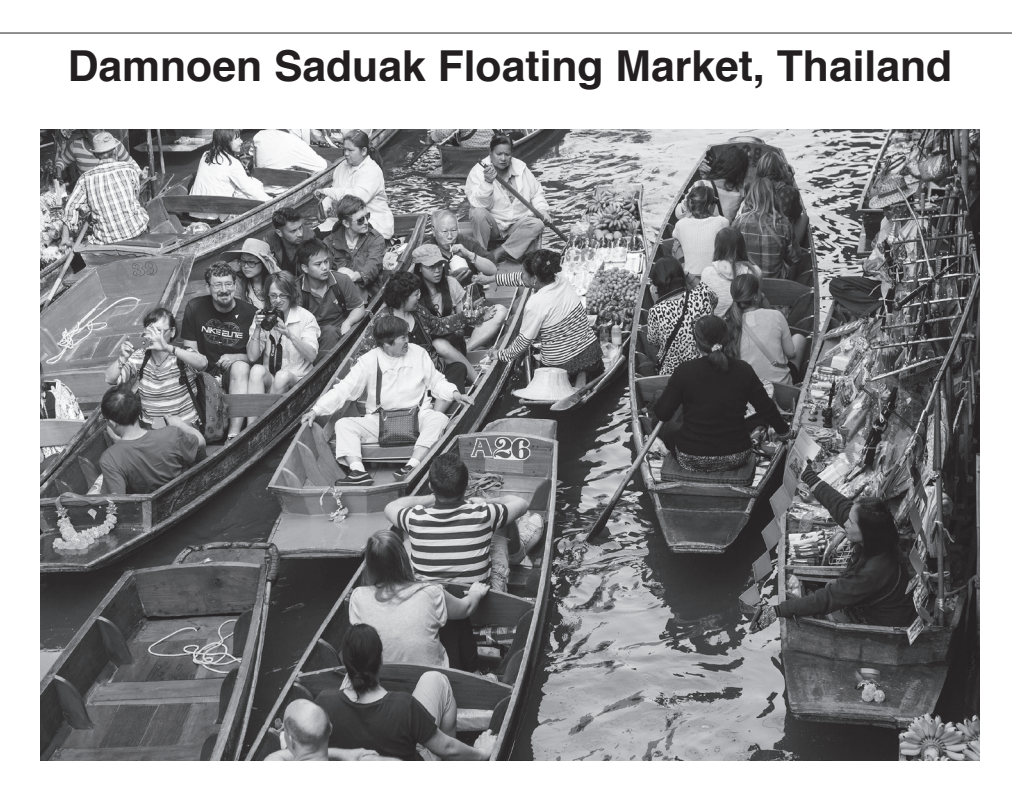
Fig. 3 for Question 4