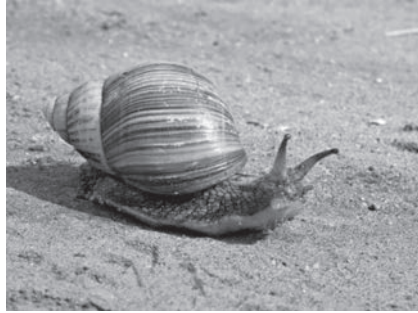
Giant African Land snail, Magnification x0.5

The student selected a snail (A) and placed it on a glass plate across which it was able to move. The student tapped the plate with a glass rod, next to the snail, causing the snail to stop moving and withdraw into its shell. The student recorded the time, in seconds, it took for the snail to re-emerge from its shell and start moving again.