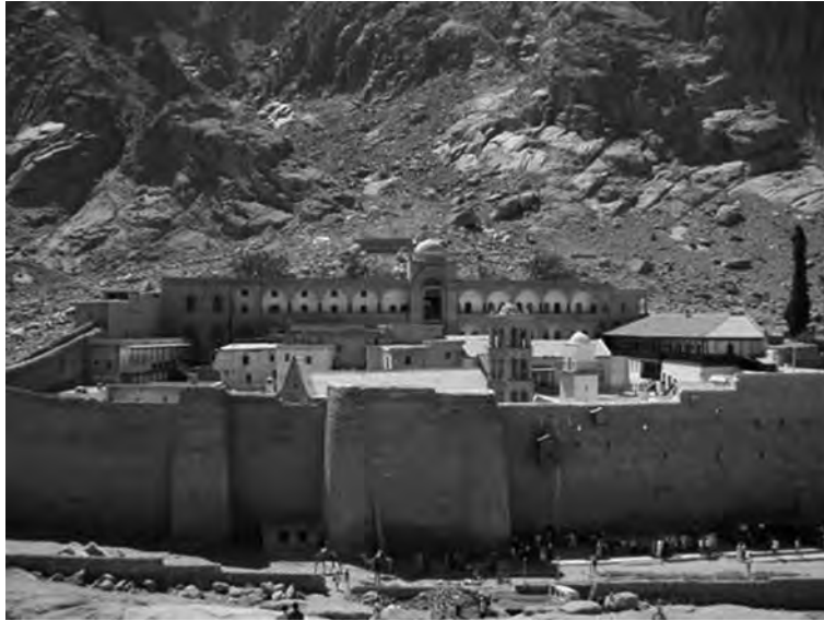
Fig. 4 for Question 4

St. Catherine's Monastery is an Orthodox monastery on the Sinai peninsula at the base of Mount Sinai in Egypt. One of the oldest Christian monasteries in the world, St. Catherine's includes the burning bush seen by Moses and contains many valuable religious icons. This area is sacred to three world religions: Christianity, Islam and Judaism.