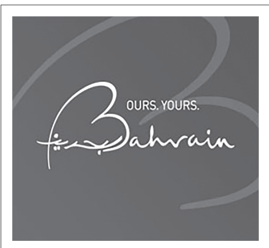
Fig. 1.1 for Question 1

The Bahrain Tourism and Exhibitions Authority (BTEA) promoted the Kingdom of Bahrain as a leading tourist destination during a roadshow held in the UK in May 2018. The promotion was led by BTEA officials and included representatives from a local airline company, a number of hotels and travel agents.