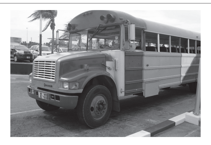
Fig. 2 for Question 2