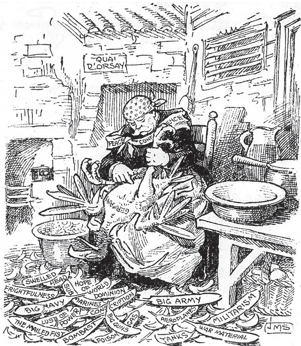
A British cartoon published in March 1919. The Quai d'Orsay was the address of the French Ministry of Foreign Affairs.