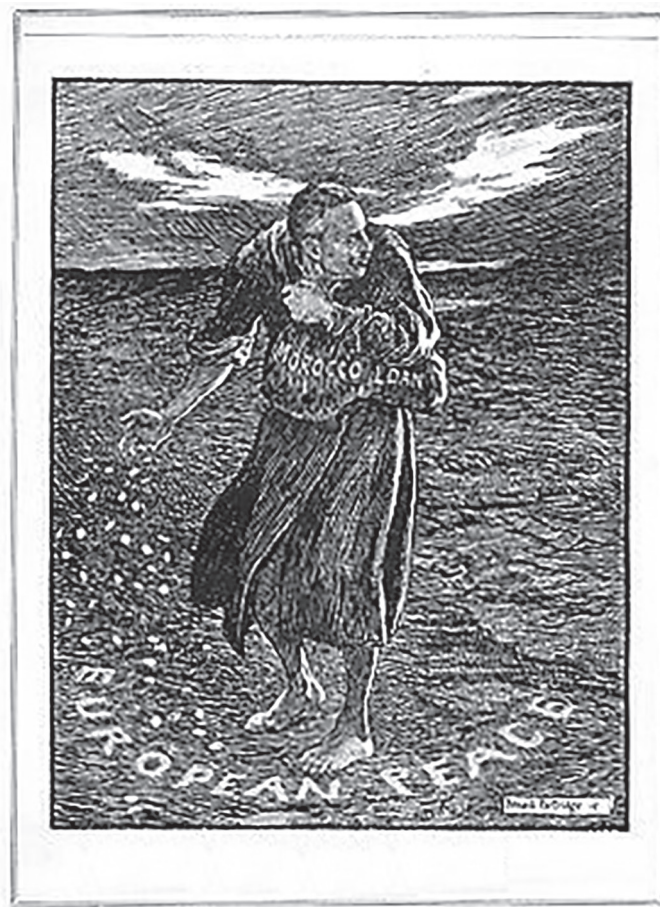
A cartoon published in a British magazine, August 1905. The title of the cartoon is 'The spreader of harmful weeds'. The figure represents the Kaiser.