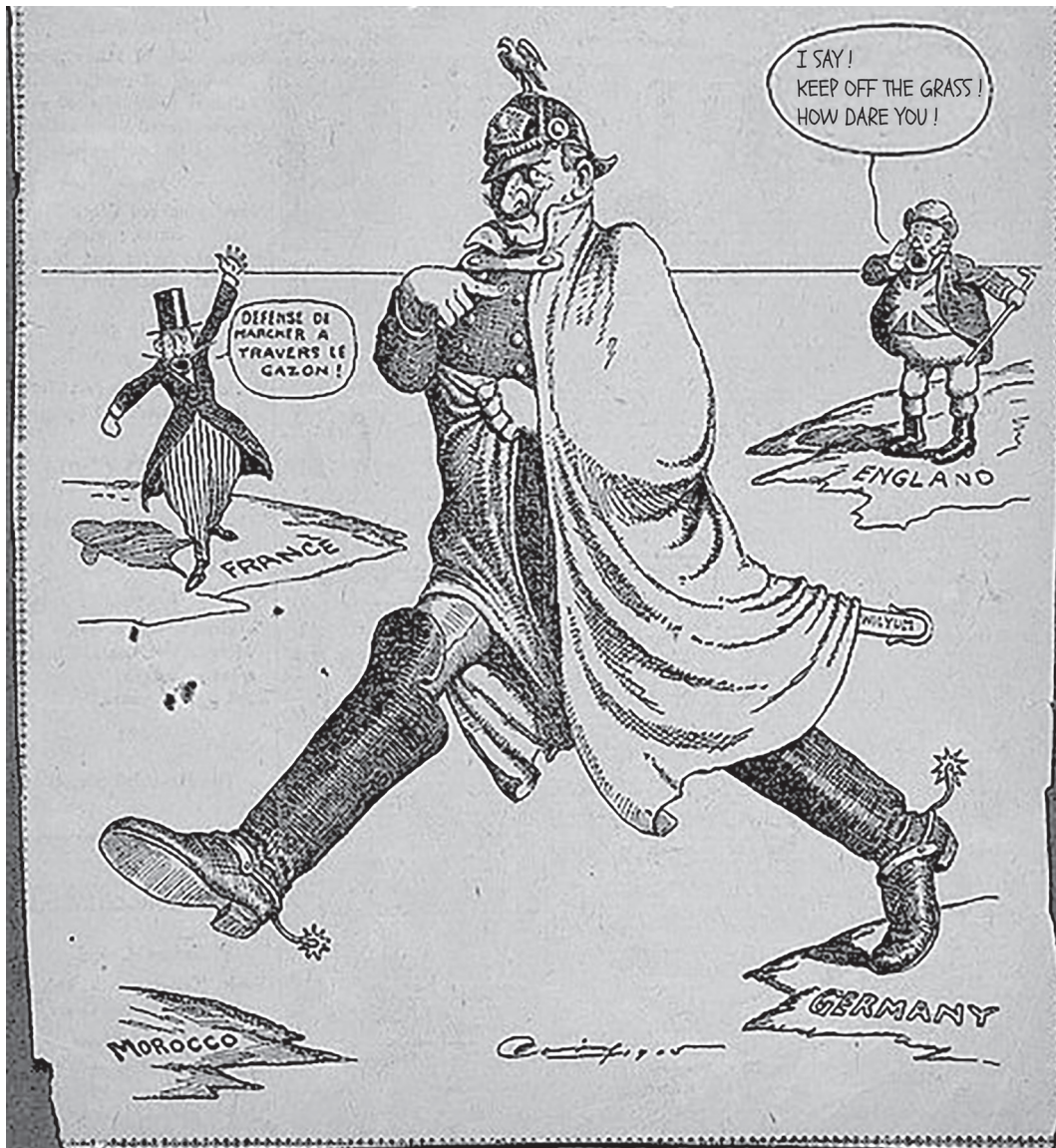
A cartoon published in a British magazine, 29 April 1905. France is shouting, 'Forbidden to walk on the grass!'