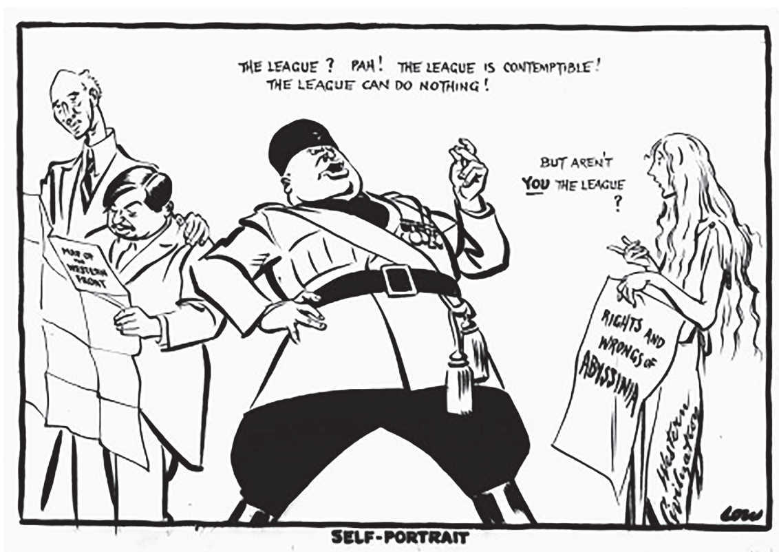
A cartoon published in Britain in February 1935. The figures on the left represent Britain and France.