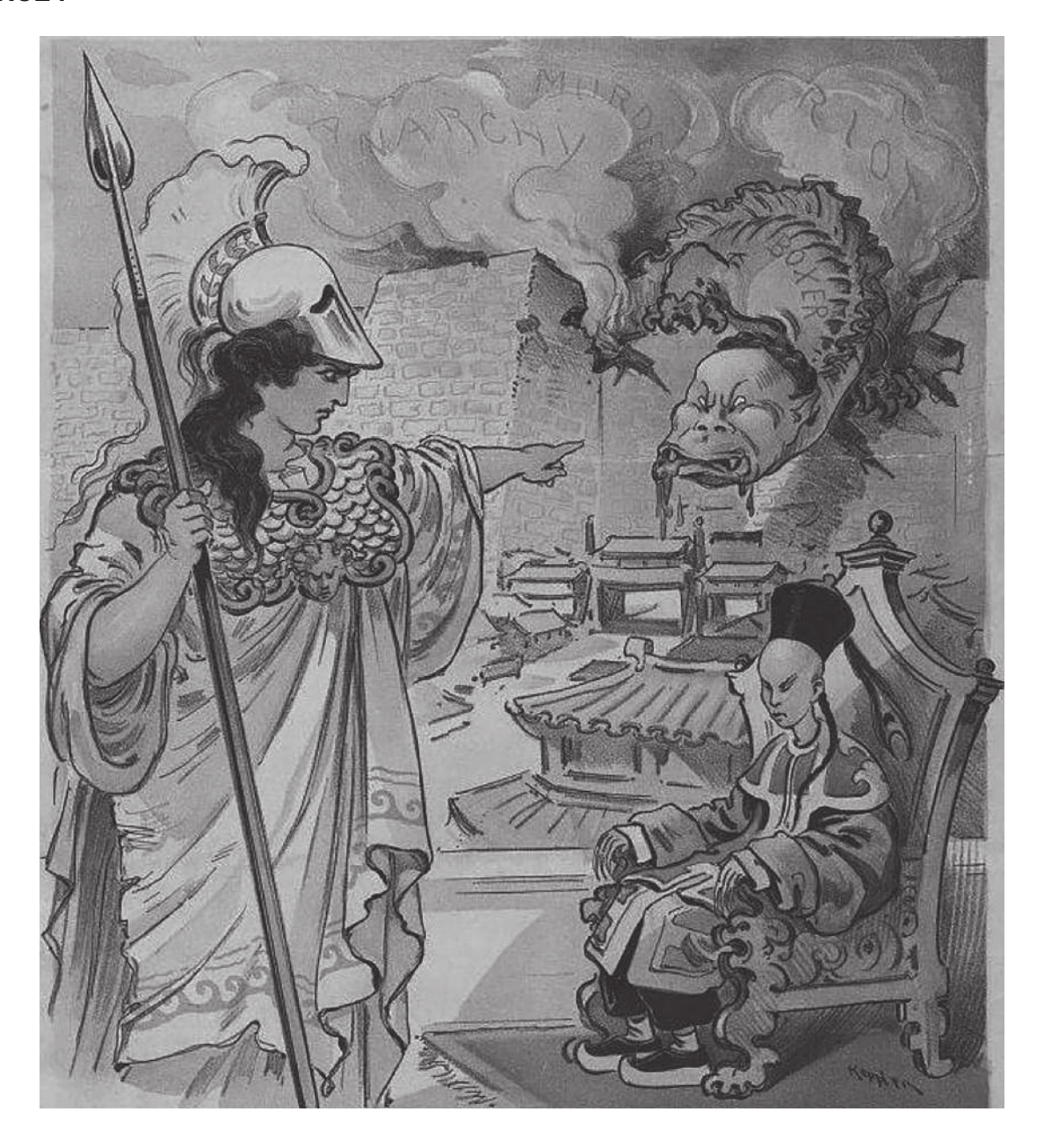
A cartoon published in an American magazine, August 1900. The caption reads 'The First Duty. Civilisation speaking to China: "That dragon must be killed before our relationship can be improved. If you don't do it, I shall have to."'