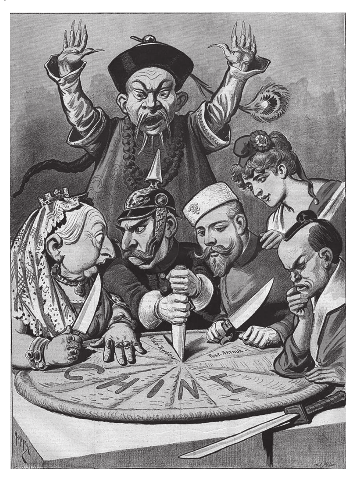
A cartoon published in a French magazine, 1898. The caption reads 'China – the cake of kings and of emperors'. The countries around the table are, from left to right, Britain, Germany, Russia, France and Japan.