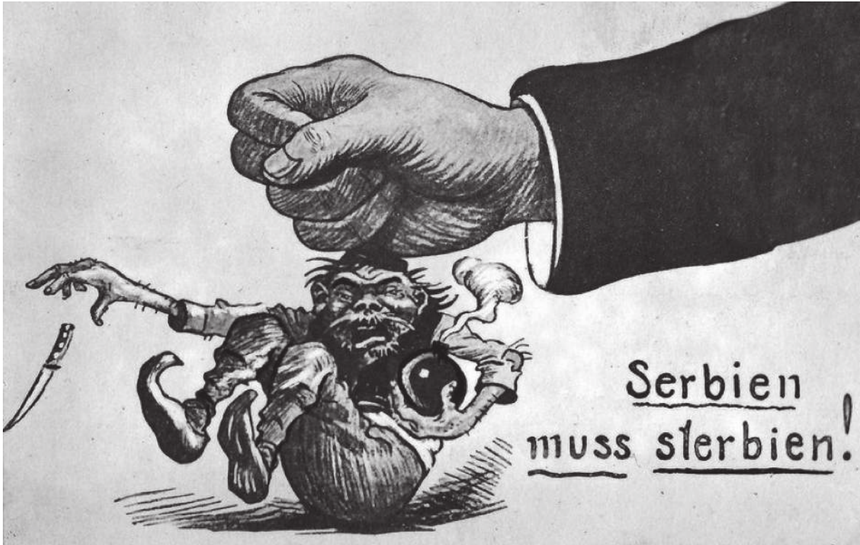
A postcard published in Austria in 1914 soon after the assassination of Franz Ferdinand. The words in the bottom right say 'Serbia must die!'