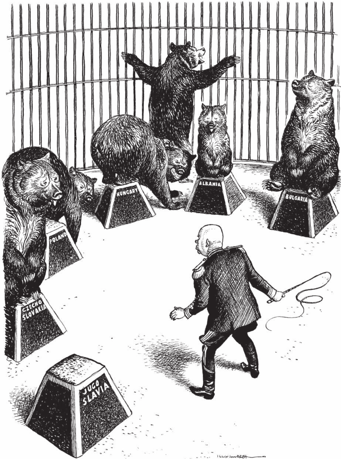
A British cartoon published on 31 October 1956. The figure with the whip is Khrushchev.