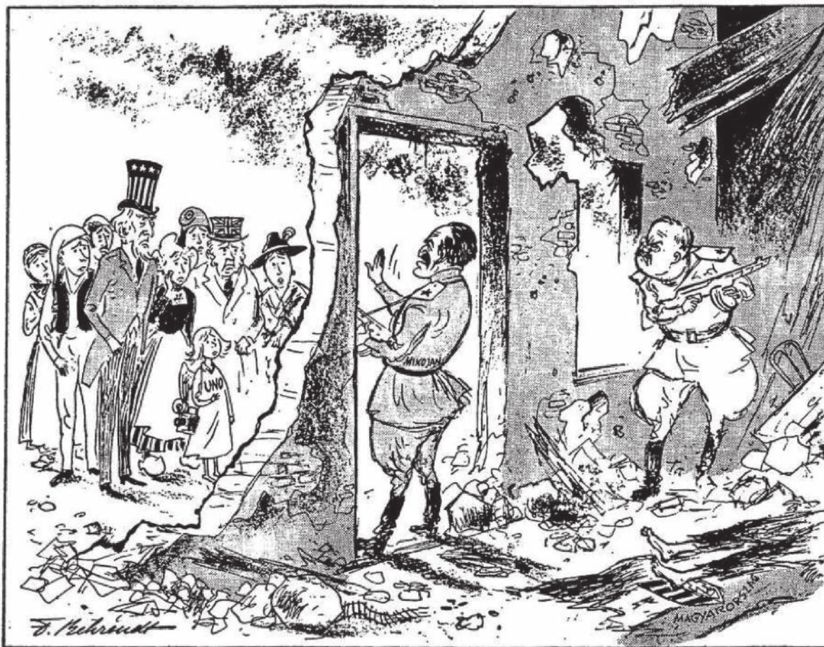
A cartoon published in Holland in November 1956. The Soviet soldier is saying 'This is a purely Hungarian matter.'