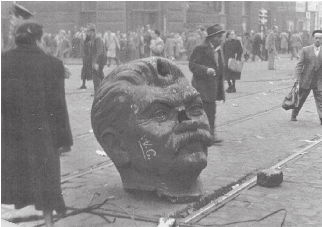
A photograph taken in Budapest, October 1956.