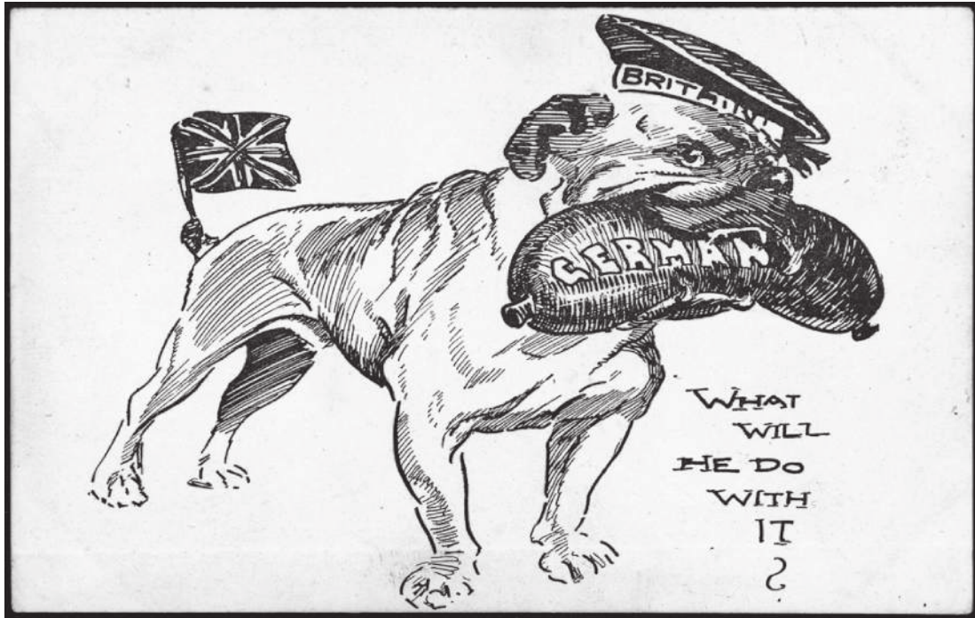
A British postcard, 1914.