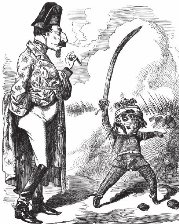
THE GIANT AND THE DWARF.

A cartoon published in Britain in June 1859. Napoleon III, on the left, is saying to King Victor Emmanuel, 'Bravo, my little fellow! You shall do all the fighting and we'll divide the glory.'