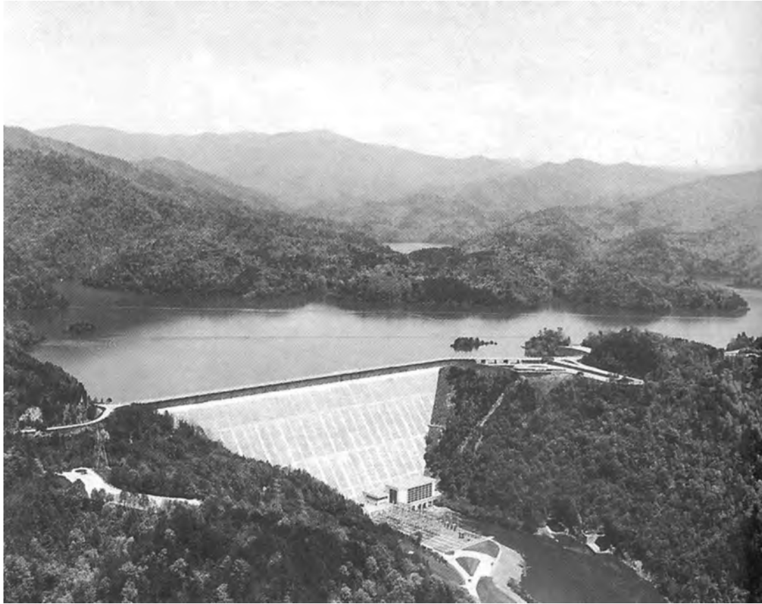
A photograph showing water management in the Tennessee Valley.

14 Look at the photograph, and then answer the questions which follow.