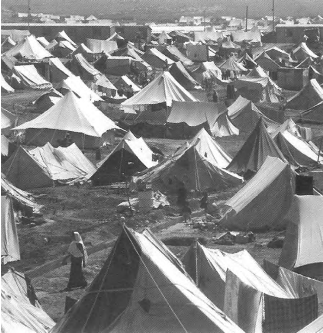
A photograph of a Palestinian refugee camp in Jordan, 1949.

21 Look at the photograph, and then answer the questions which follow.