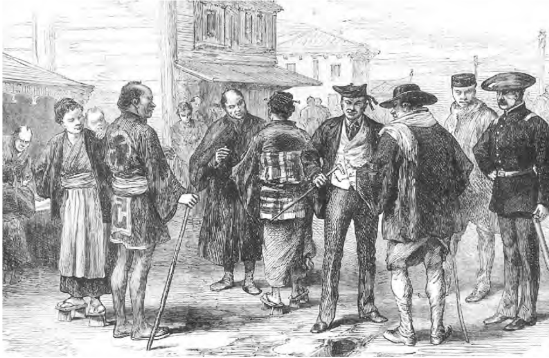
Japanese people wearing traditional and western costumes in 1873.

3 Look at the illustration, and then answer the questions which follow.