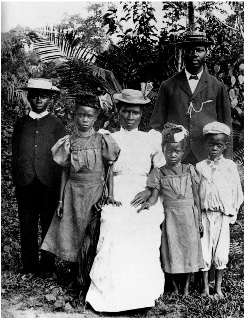
Photograph taken in 1898 of an African family who lived with Christian missionaries who wanted to show that Africans could be westernised.