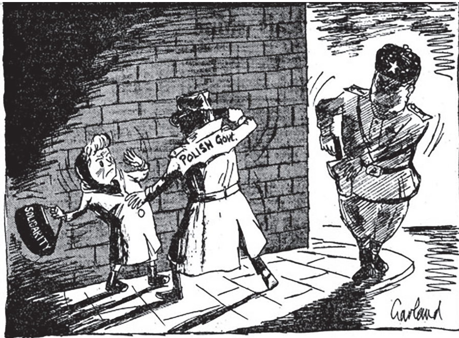
"Excuse me sir — is this lady bothering you?"

A cartoon published in Britain, 5 December 1980. The figure on the right represents Brezhnev.