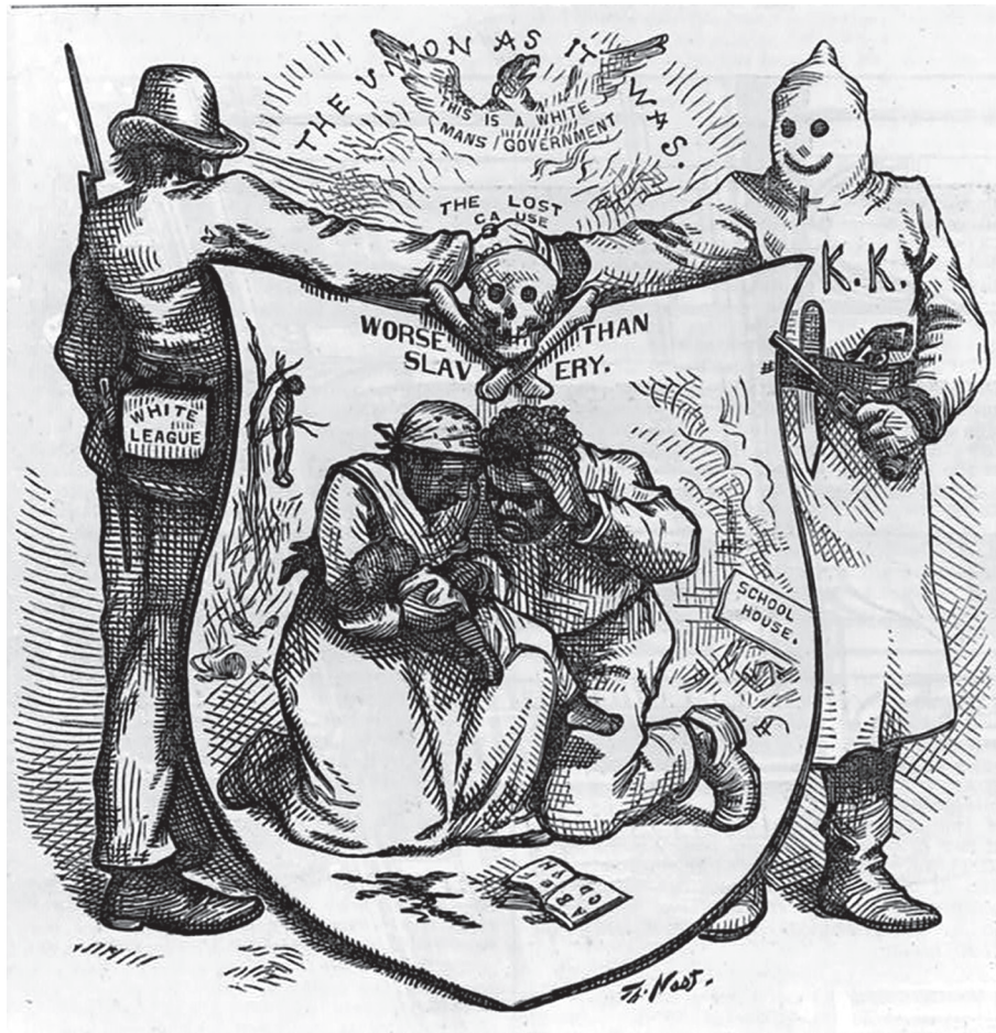
A cartoon published in an American magazine, October 1874.