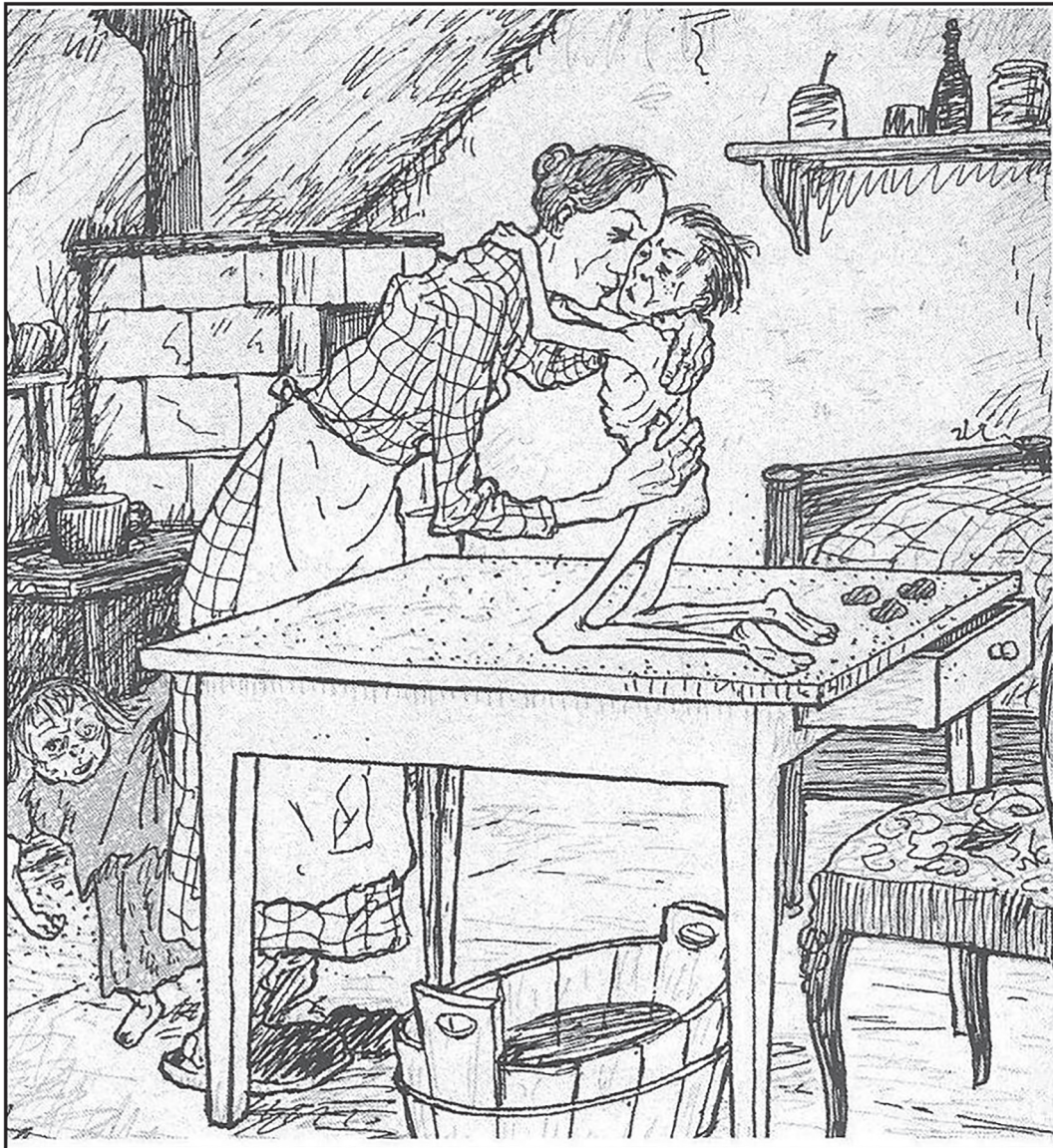
A cartoon entitled 'Consolation' published in a German magazine, 24 June 1919. The mother is saying to her child, 'When we have paid 100,000,000,000 marks, then I shall be able to give you something to eat.'