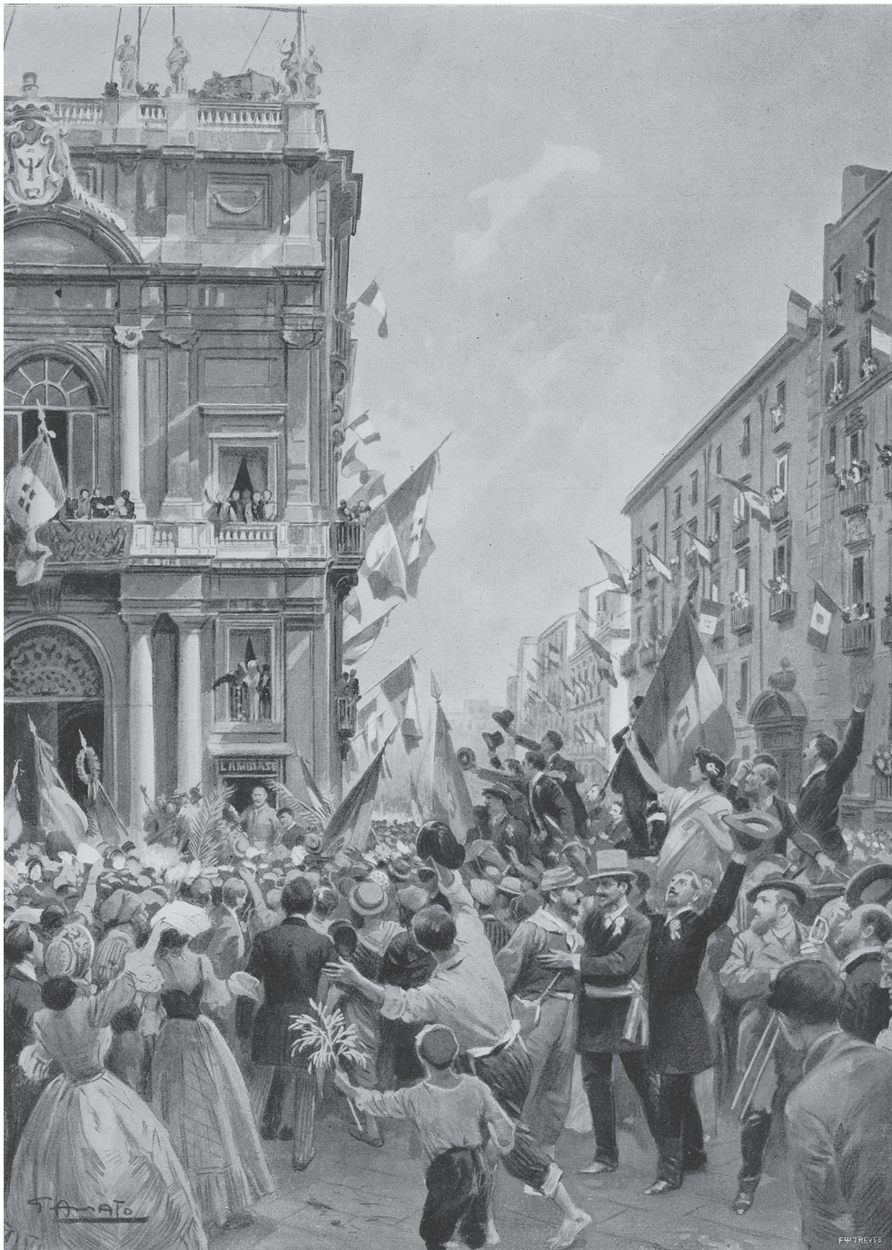
An Italian drawing from 1910 of Garibaldi announcing from a balcony in Naples the annexation of the Kingdom of the Two Sicilies to Italy in September 1860.