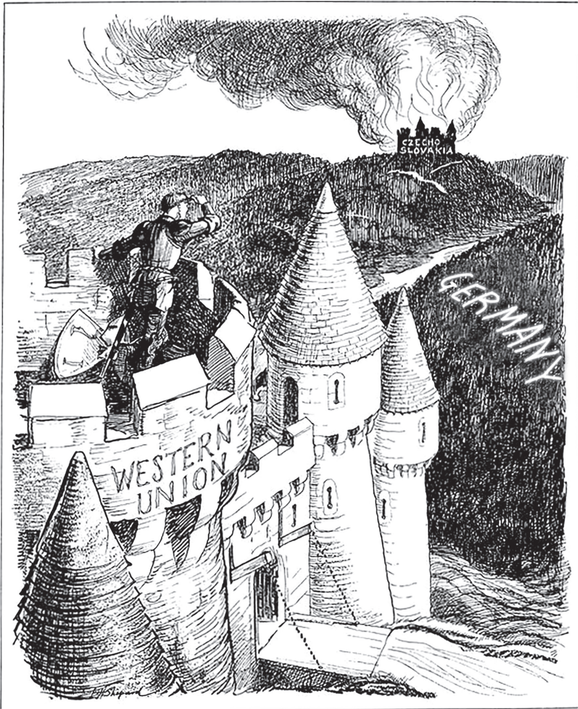
THE TOWER OF SAFETY

A cartoon published in a British magazine, 17 March 1948.