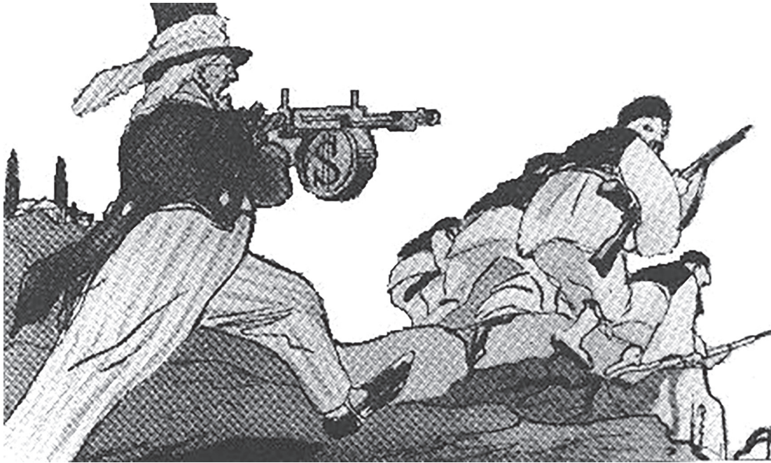
A cartoon published in the Soviet Union in 1947. It shows American aid during the Greek civil war.