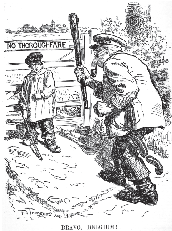
A cartoon published in Britain, 12 August 1914.