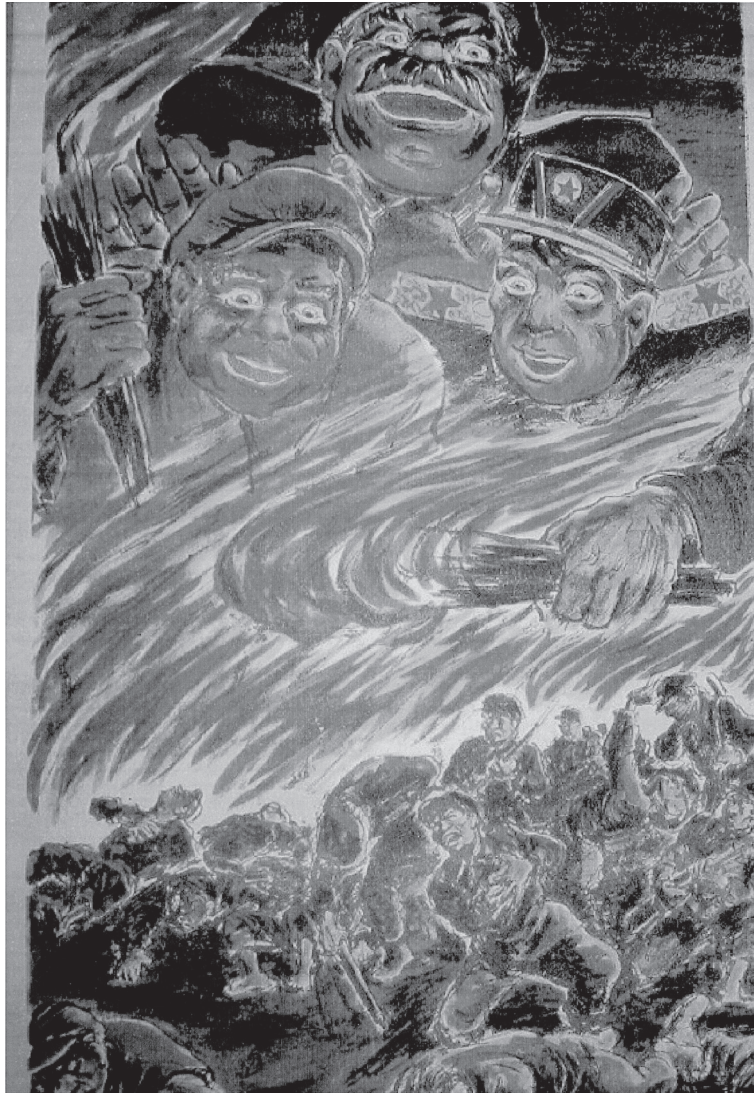
A leaflet distributed in Korea during the war. The figures at the top represent Mao Zedong, Stalin and Kim Il-sung. Kim Il-sung was the Prime Minister of North Korea.