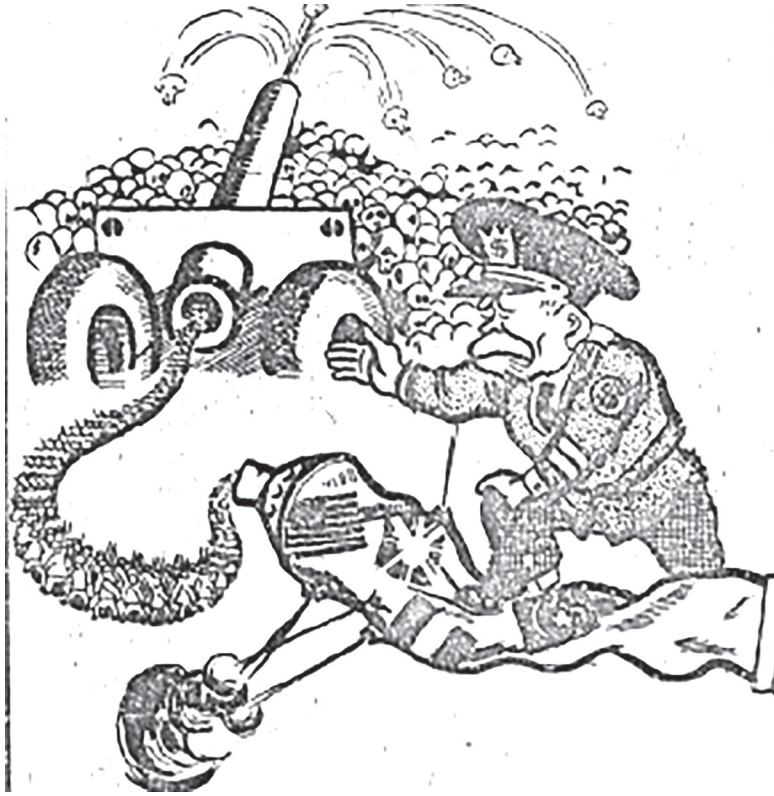
A leaflet distributed in Korea during the war. It shows UN troops being squeezed out of a toothpaste tube and into a cannon where they are fired northward.