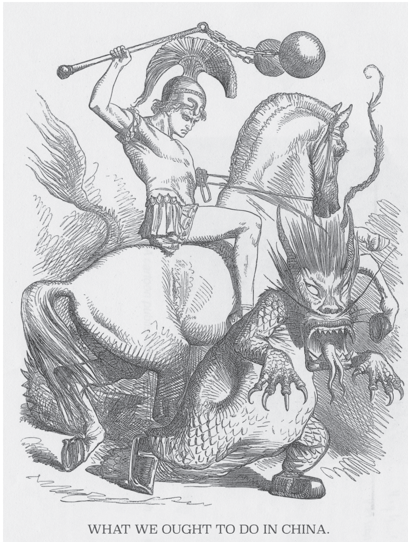
A cartoon published in December 1860 in a British magazine.