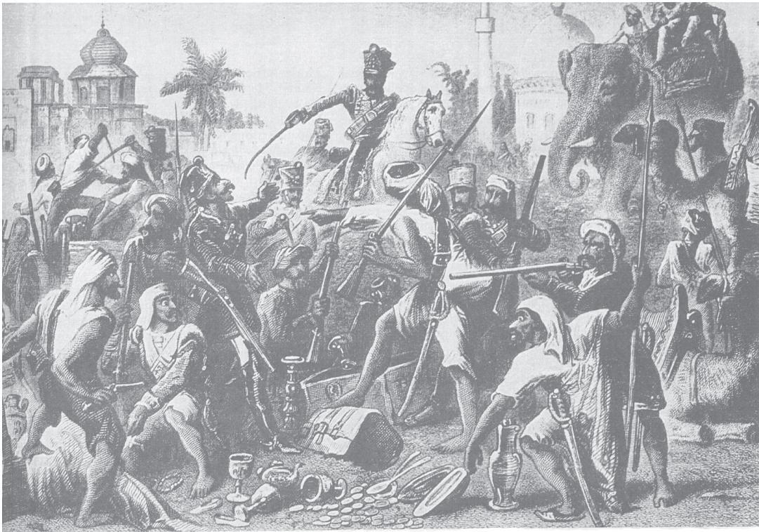
An illustration entitled 'Mutinous Sepoys Dividing Spoils' from 'The History of the Indian Mutiny', published in Britain in 1860. 'Spoils' means the items stolen during the fighting.