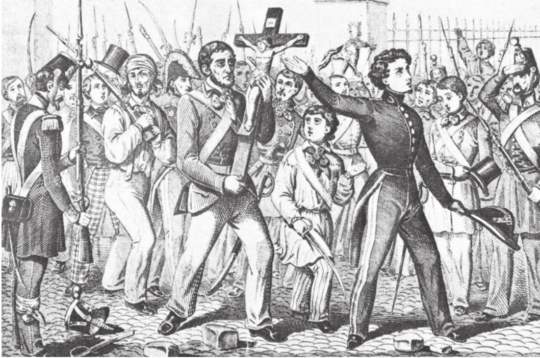
A drawing from the time of protestors on 24 February 1848, rescuing a crucifix from the Tuileries and taking it to the church of Saint-Roch.