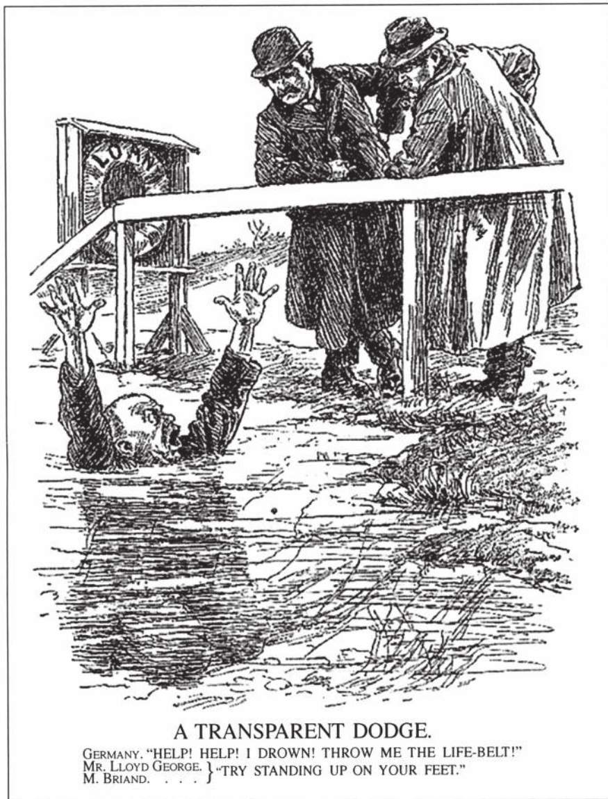
A cartoon from a British magazine, 1921. It shows Germany kneeling in the water. Lloyd George and Briand (the French Prime Minister) are on the right.