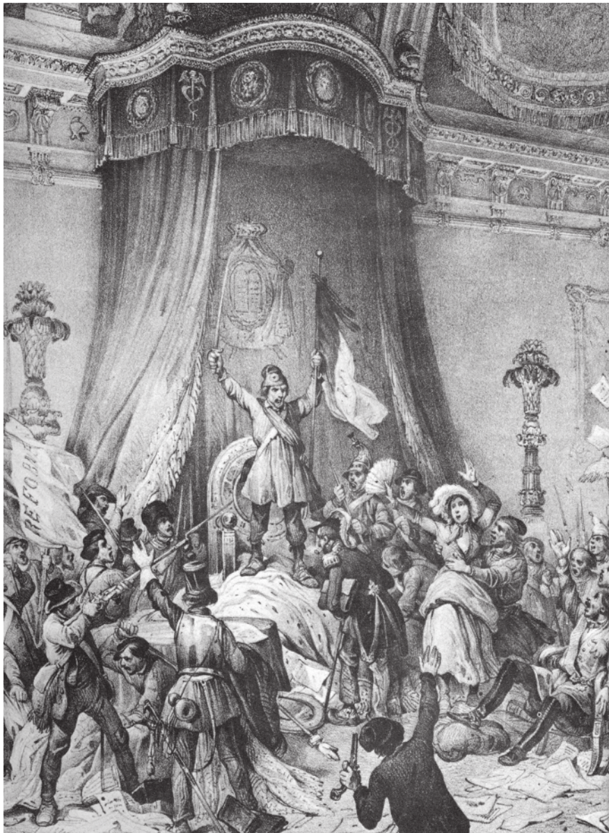
A drawing from the time of the throne room in the Tuileries, Louis Philippe's palace, 24 February 1848.