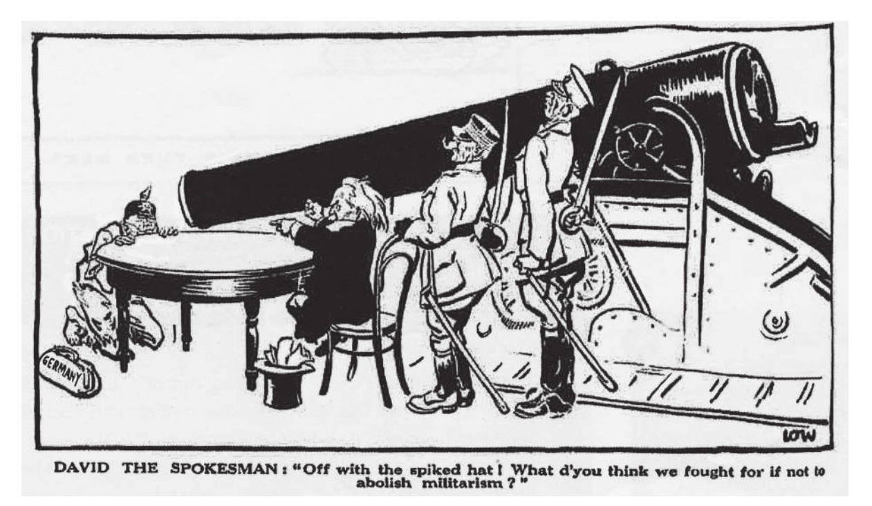
A British cartoon published in July 1920. It shows the first meeting between Allied leaders and Germany since the signing of the Treaty of Versailles.