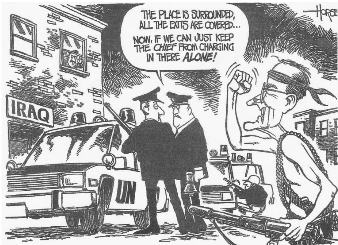
A cartoon published in the USA in late 1990. The figure on the right is President Bush.