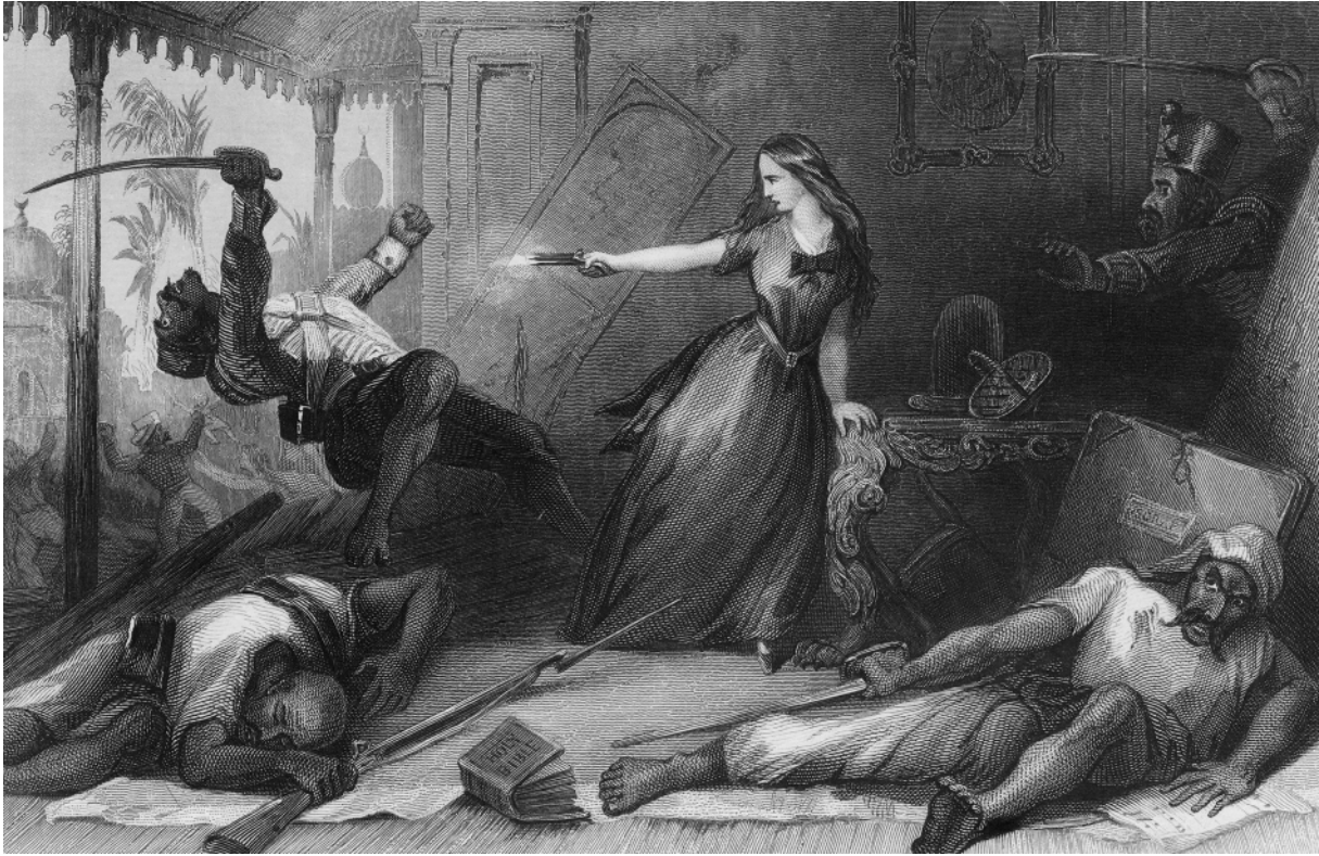
An illustration about the massacre of British women and children by rebels at Cawnpore in June 1857. It was published in Britain at the time. The book on the floor is a bible.