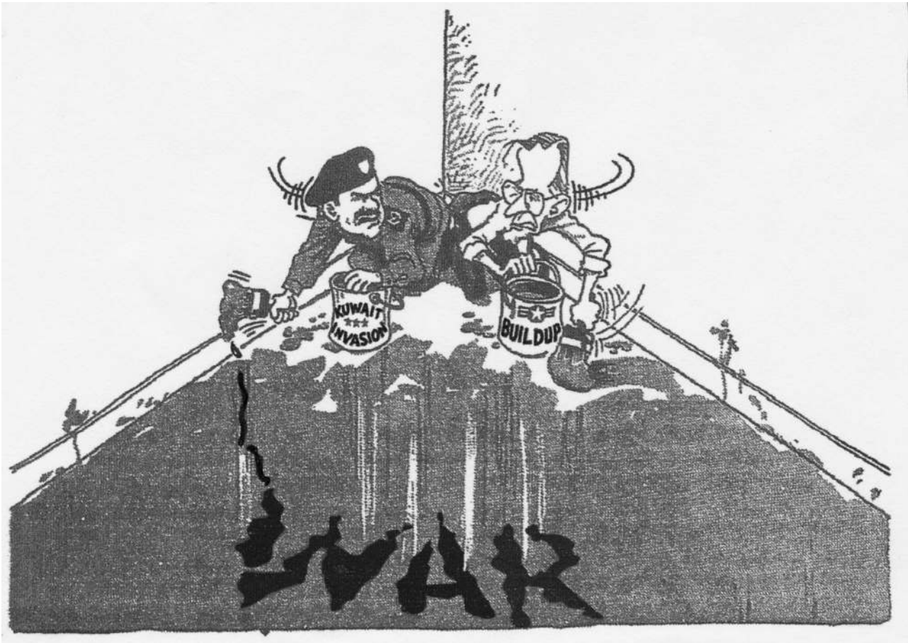
A cartoon published in the USA at the end of 1990. It shows Saddam Hussein and President Bush.