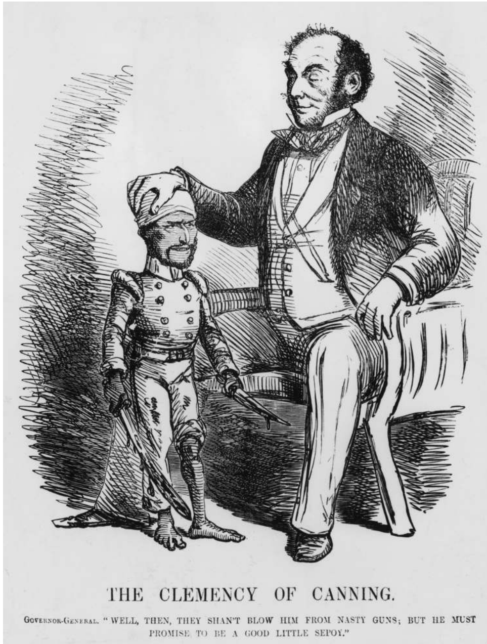
A cartoon published in Britain, November 1857. 'Clemency' means forgiveness and leniency.