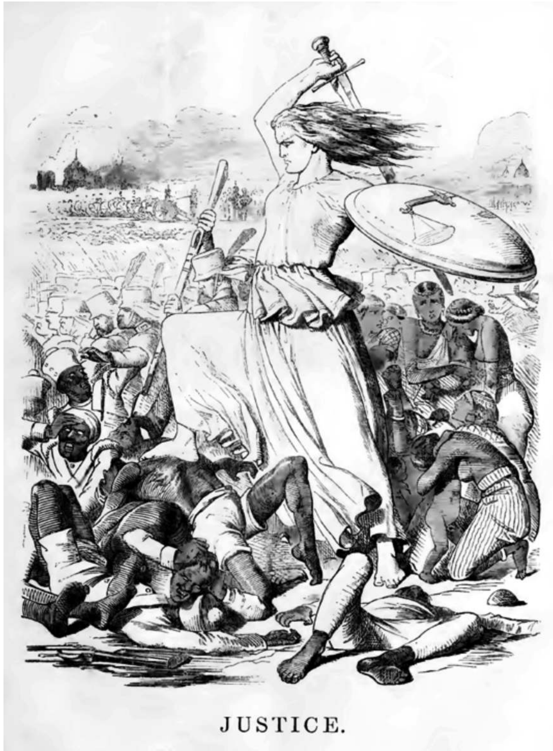
A cartoon from a British magazine, September 1857.