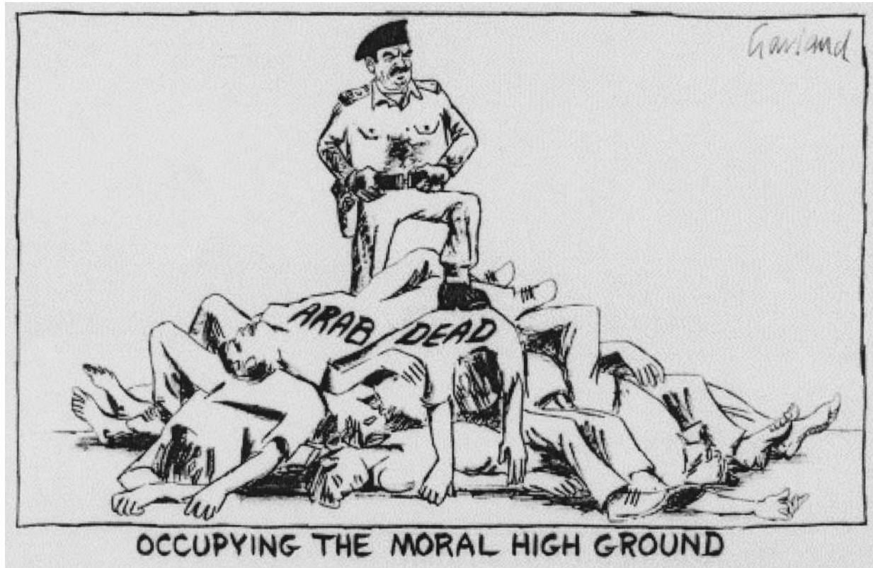
A cartoon published in Britain in October 1990.