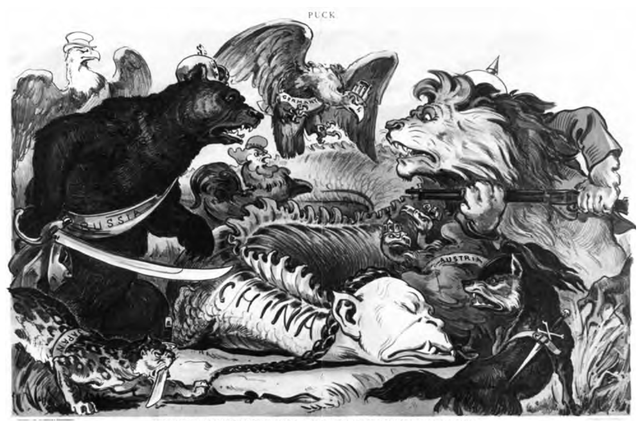
THE REAL TROUBLE WILL COME AFTER THE FUNERAL

Cartoon from an American magazine in the late nineteenth century. The caption beneath says, 'The real trouble will come after the funeral.'