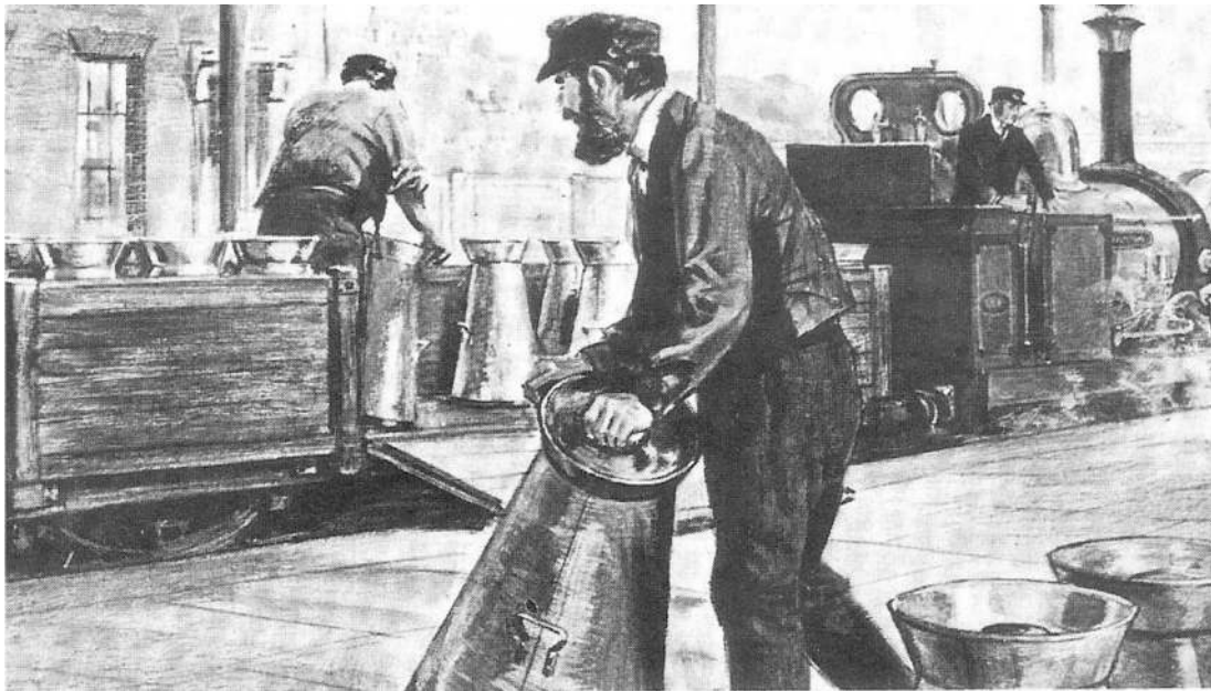
Milk churns being taken by train from farms in the west of England to the City of London.

22 Look at the illustration, and then answer the questions which follow.