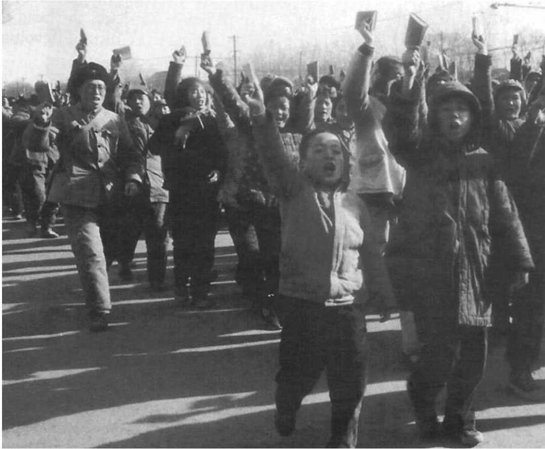
A photograph of Red Guards on the streets of Beijing during the Cultural Revolution.

16 Look at the photograph, and then answer the questions which follow.