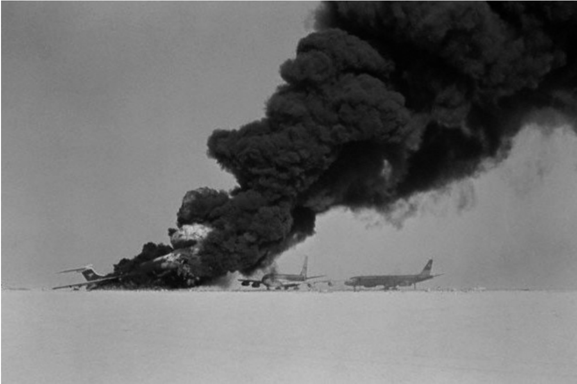
A photograph of a hijacked airliner, Jordan 1970.

21 Look at the photograph, and then answer the questions which follow.