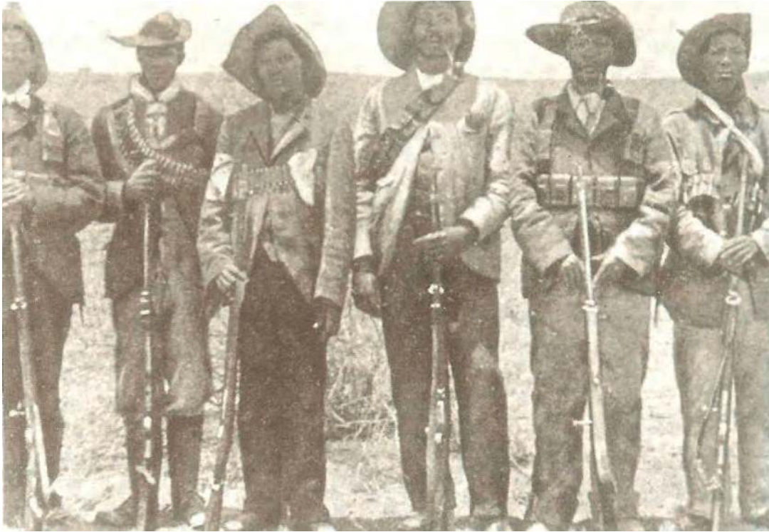
A photograph of Marenga and his guerrilla fighters in 1904.

19 Look at the photograph, and then answer the questions which follow.