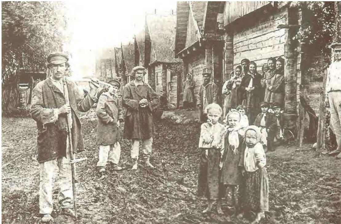
A photograph of a Russian village street around the beginning of the twentieth century.