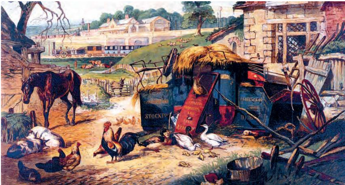
A painting of a country scene produced around 1845.

22 Look at the painting, and then answer the questions which follow.