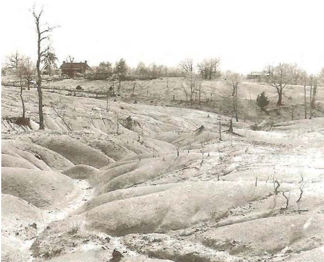
A photograph showing the effects of erosion in the Tennessee Valley.

14 Look at the photograph, and then answer the questions which follow.