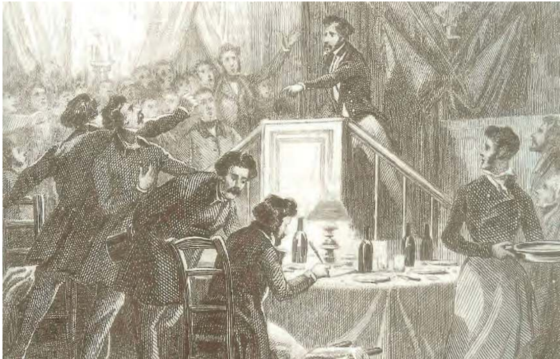
An illustration of a reform banquet held in Paris in 1847.