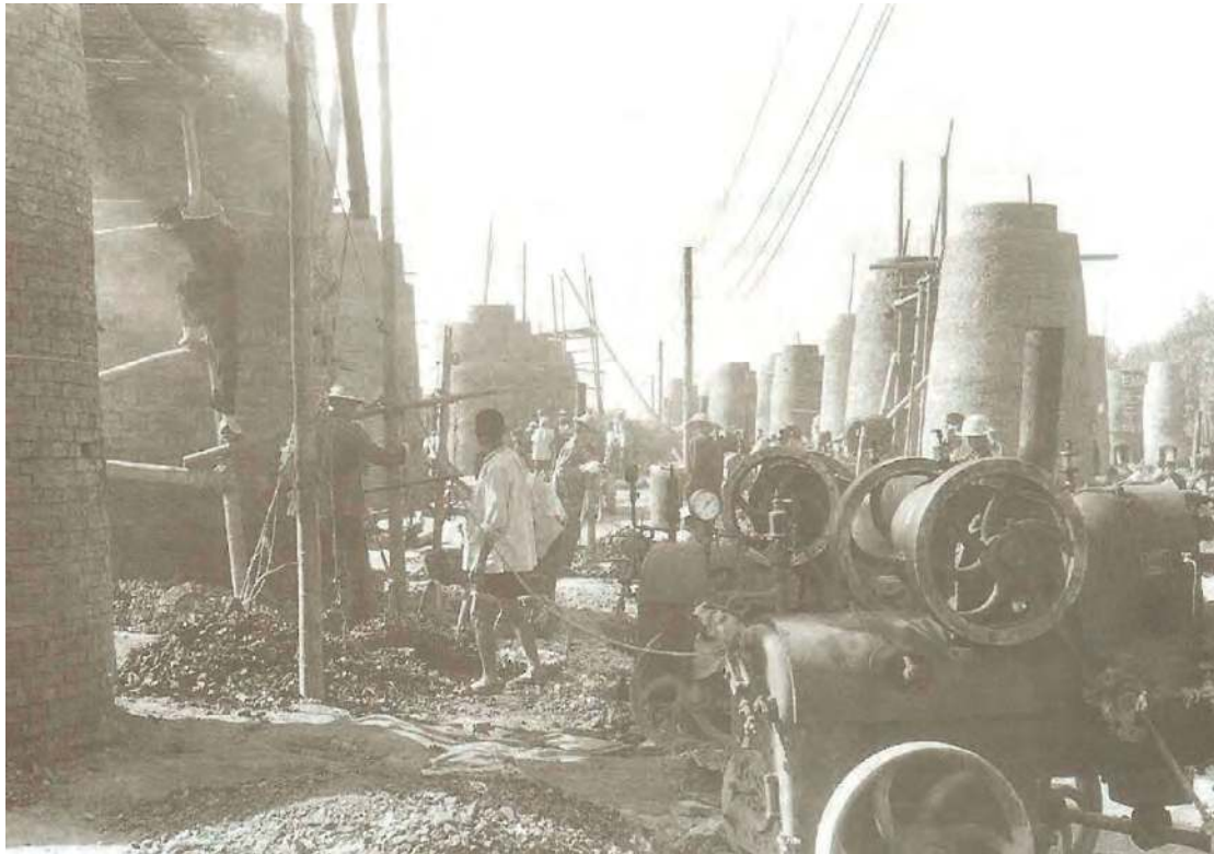
A photograph of 'Backyard Furnaces' in use during the Great Leap Forward.

15 Look at the photograph, and then answer the questions which follow.