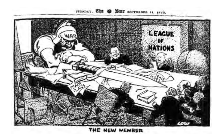
A British cartoon published in September 1923.