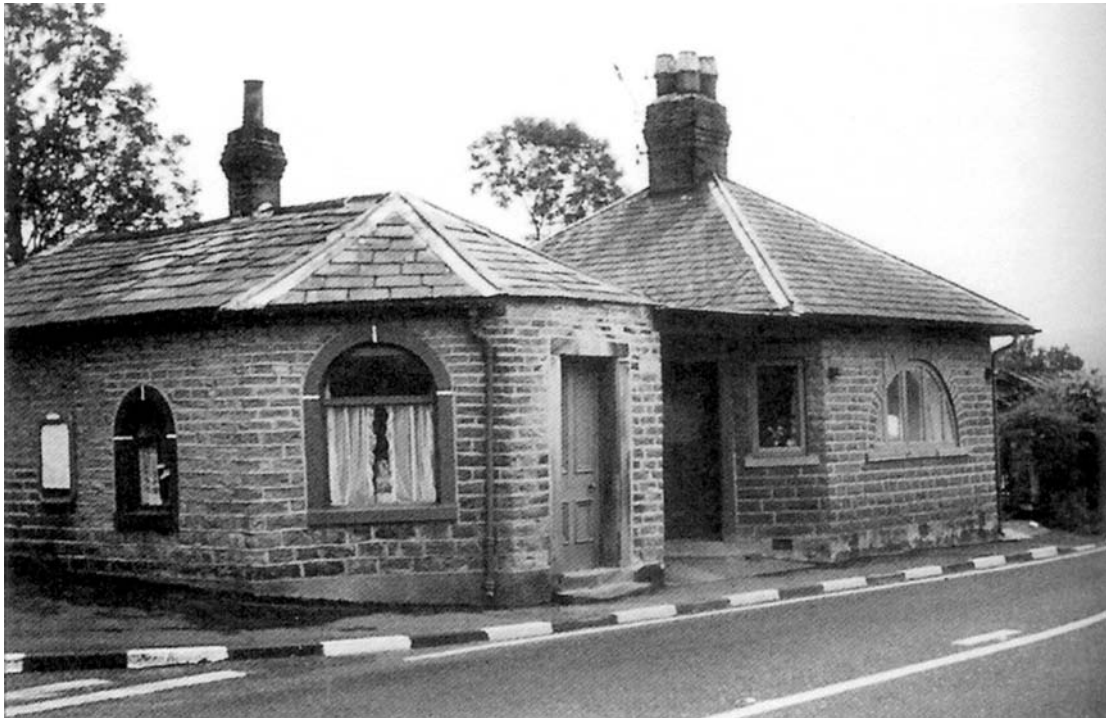
A picture of an eighteenth-century toll-house.

22 Study the photograph, and answer the questions which follow.