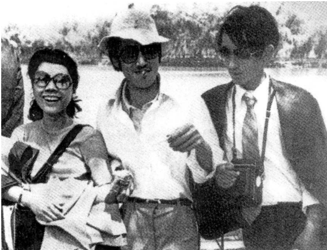
Young Chinese people on the streets of Beijing in the 1980s.

16 Study the photograph, and then answer the questions which follow.