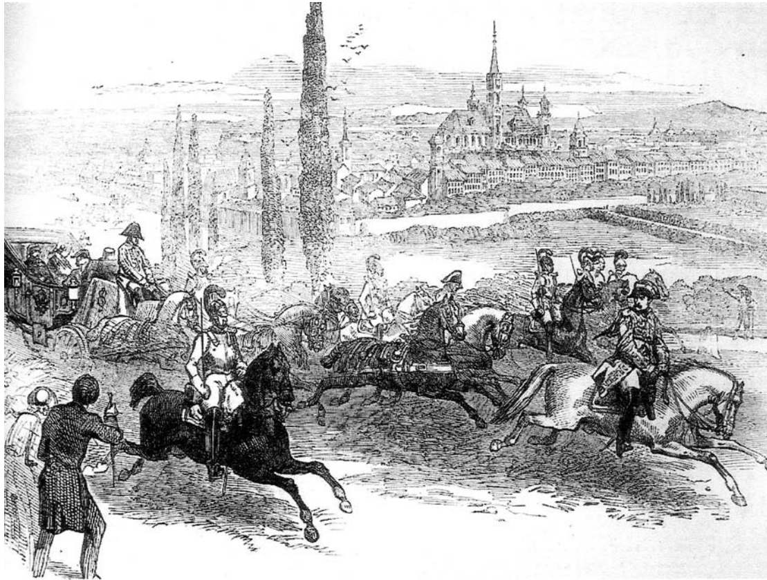
The Emperor of Austria abandoning Vienna and heading to Innsbruck, May 1848.