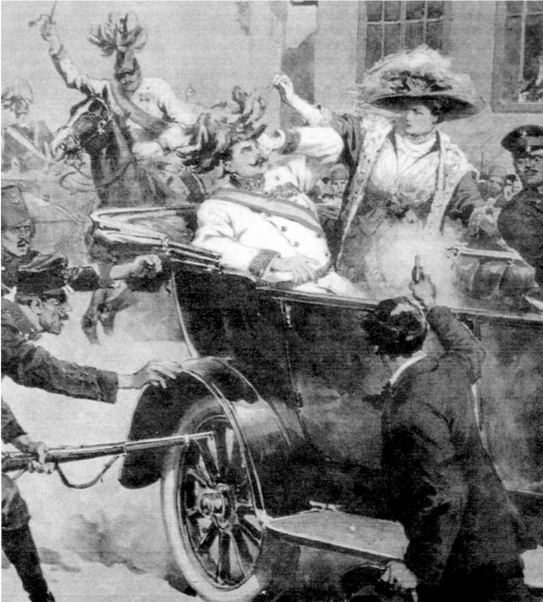
An illustration of the assassination of Franz Ferdinand and his wife in Sarajevo, June 1914.