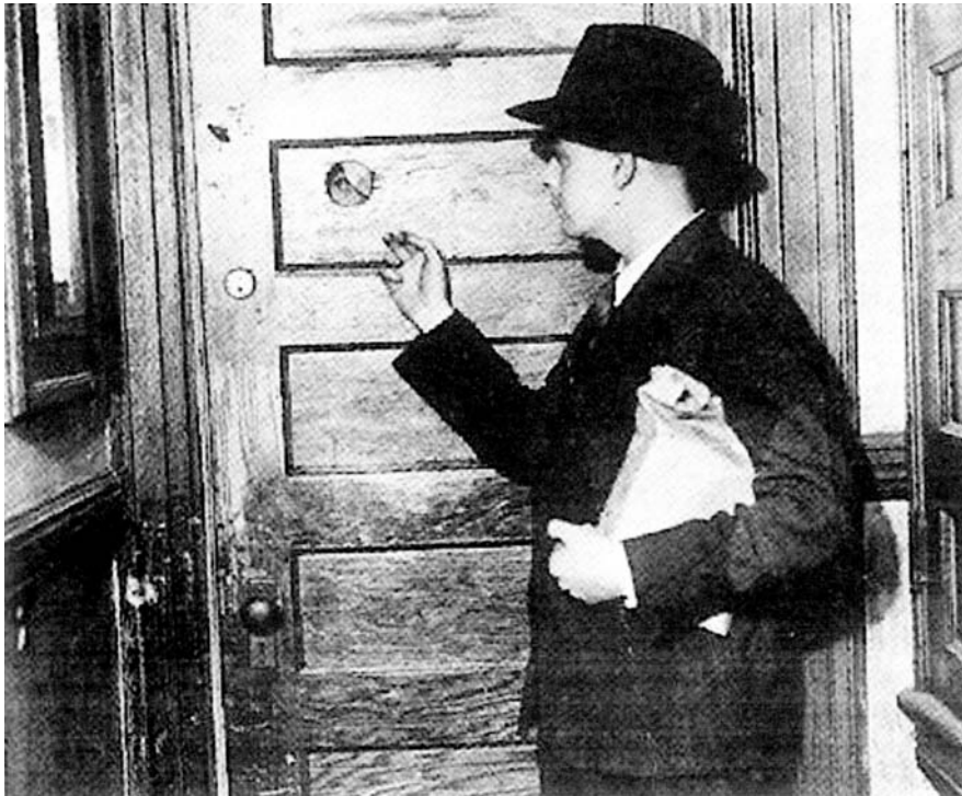
An American visiting a speakeasy.

13 Study the photograph, and then answer the questions which follow.