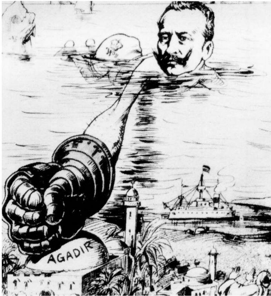
A cartoon about the Second Moroccan Crisis, published in 1911.