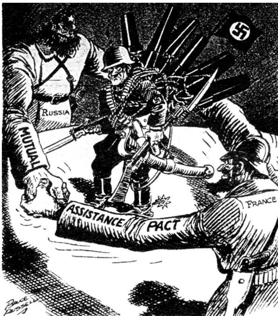
An American cartoon published in March 1936.