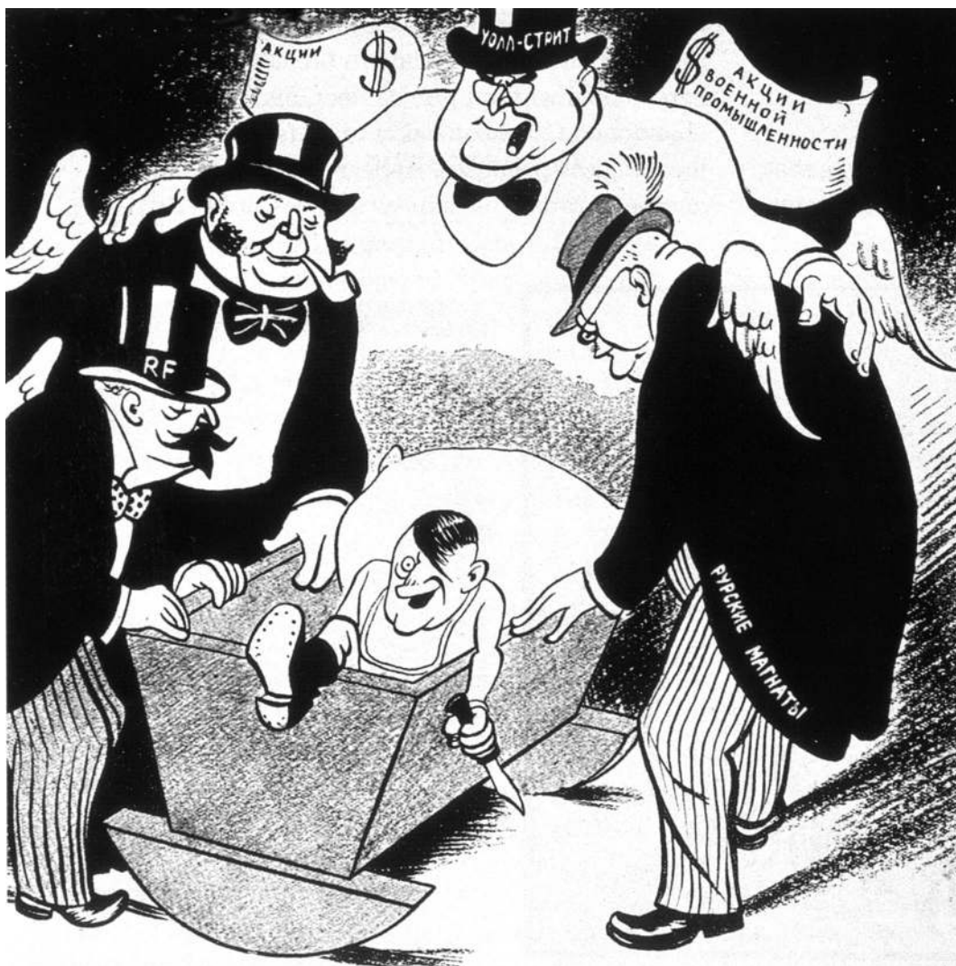
A Soviet cartoon published in 1936. It shows the western countries with Hitler.