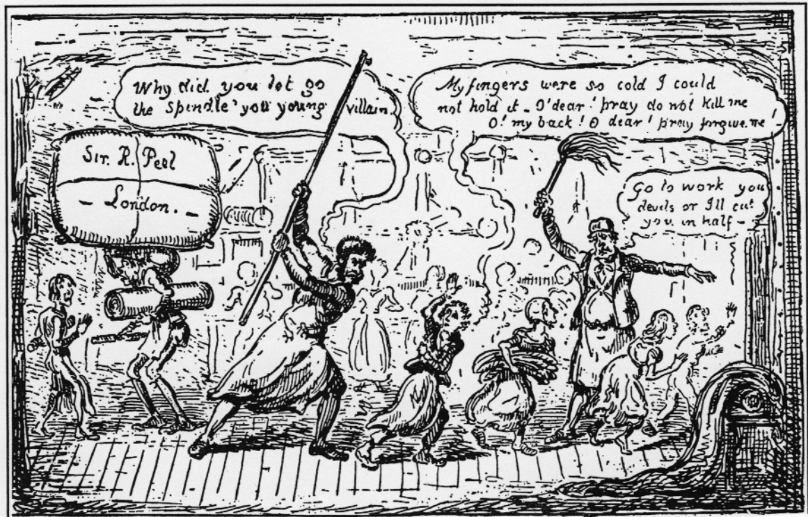
An early nineteenth century cartoon titled 'The Factory Slaves. Their daily employment'.

22 Study the cartoon, and then answer the questions which follow.