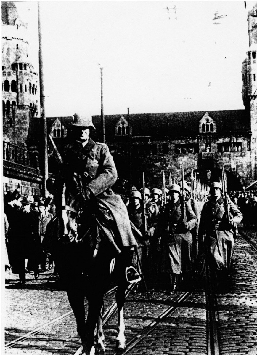
German soldiers entering Cologne in the Rhineland, March 1936.