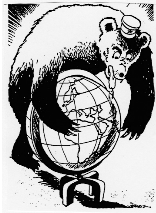
An American cartoon from the late 1940s. The bear represents the USSR.