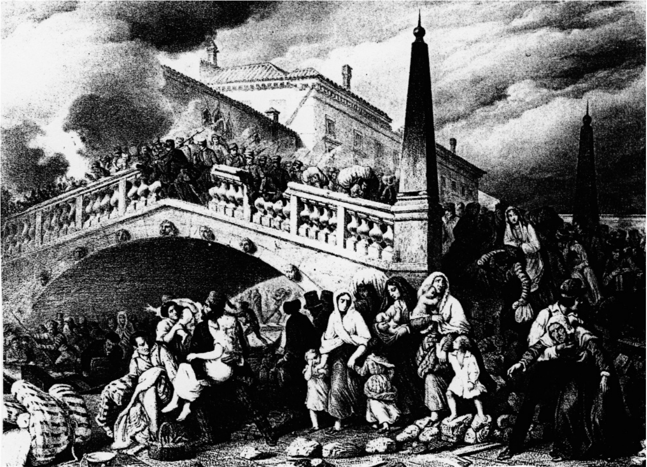
The siege of Venice, 1849