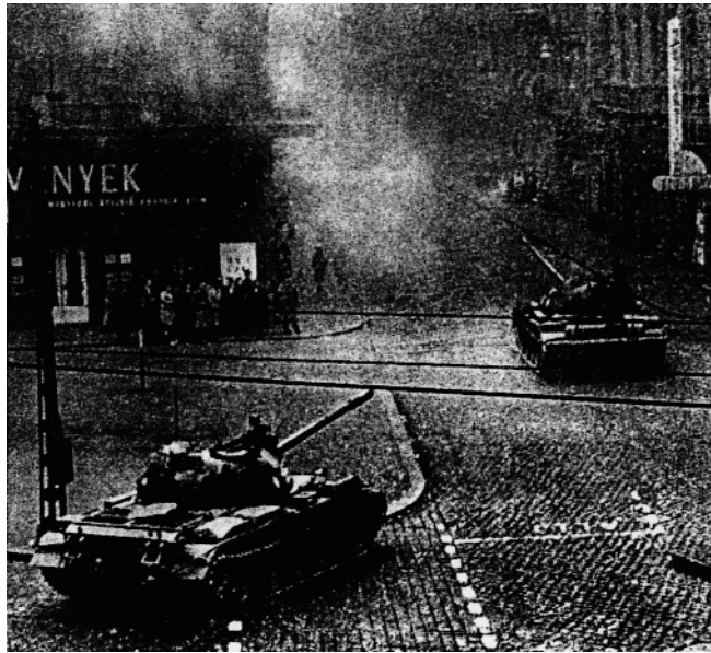
Soviet tanks in Budapest, November 1956.