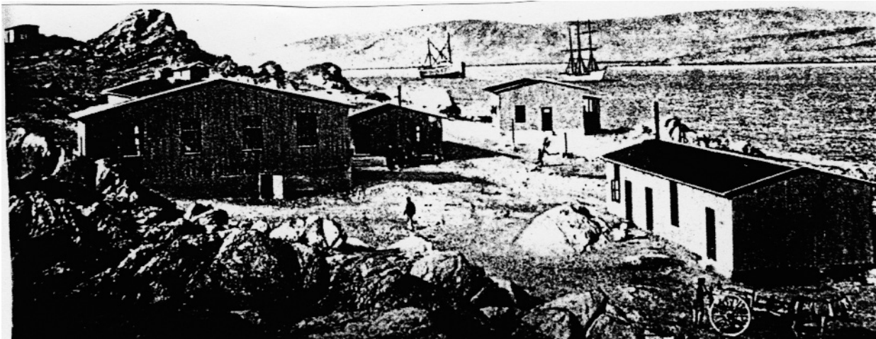
An early German trading post.

19 Study the picture, and then answer the questions which follow.