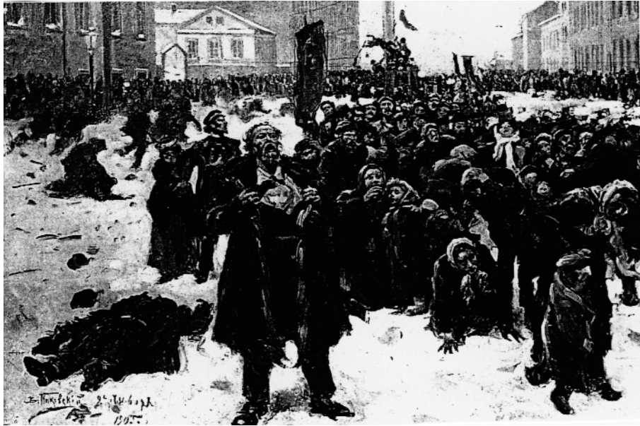
Bloody Sunday – a painting from c.1910.

11 Study the painting, and then answer the questions which follow.