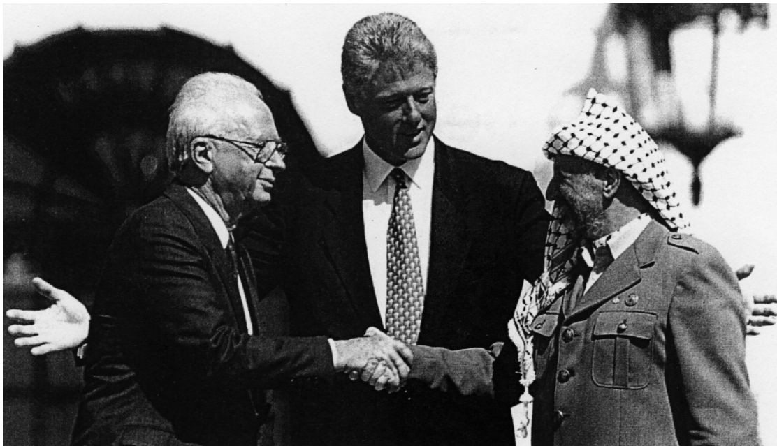
President Clinton with Rabin and Arafat after the signing of the Israeli-PLO peace accord, September 1993.

21 Study the photograph, and then answer the questions which follow.