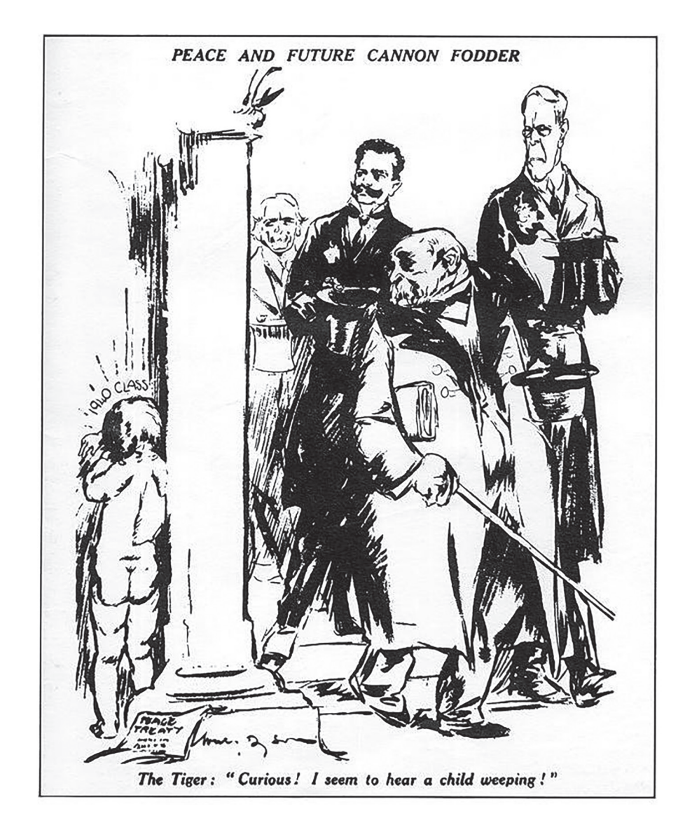
A cartoon published in a British newspaper, 13 May 1919.