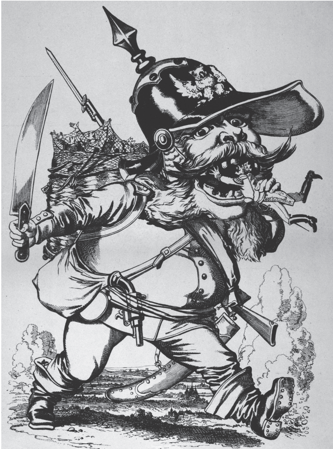
A French cartoon of King William I and the princes of northern Germany, 1867.