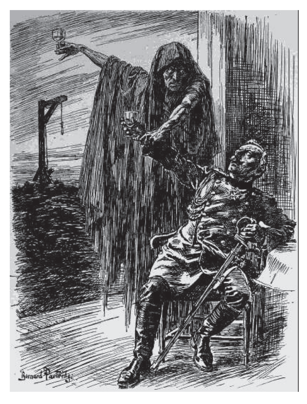
A cartoon published in Britain in 1915. The Kaiser is saying 'To the Day...', but the figure of Death adds the words '...of reckoning!'