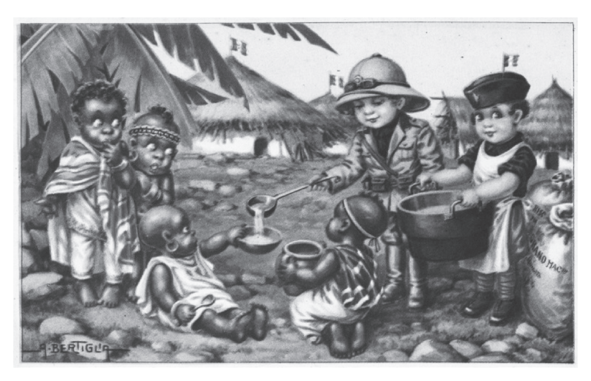
A postcard published in Italy in 1936 showing Italian and Abyssinian children in Abyssinia.