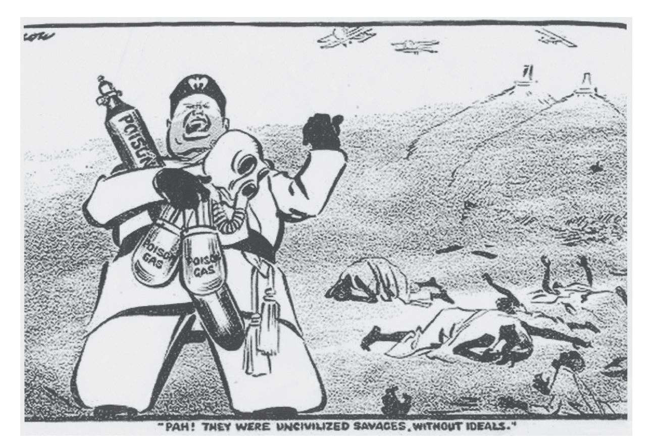
A cartoon published in an English newspaper, 3 April 1936.