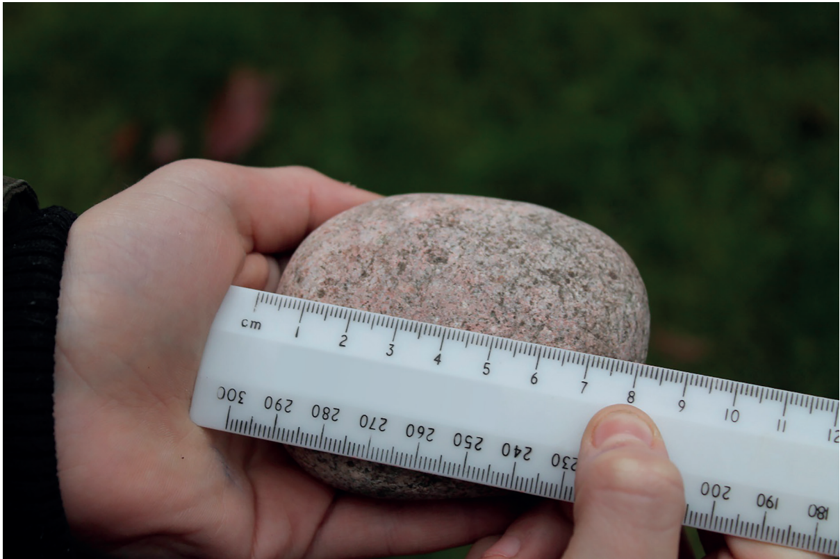
Measuring the pebble