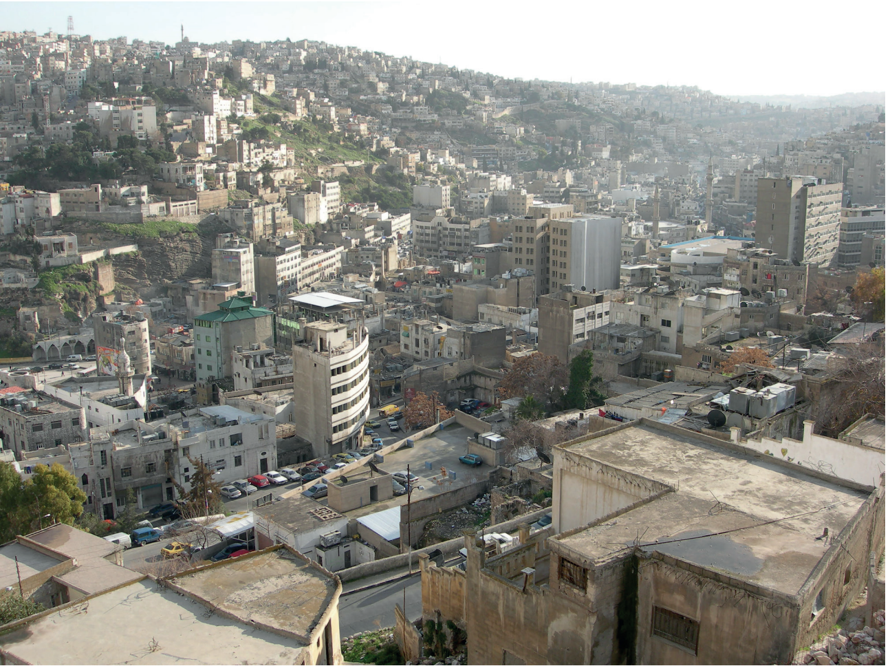
Fig. 1.2 for Question 1