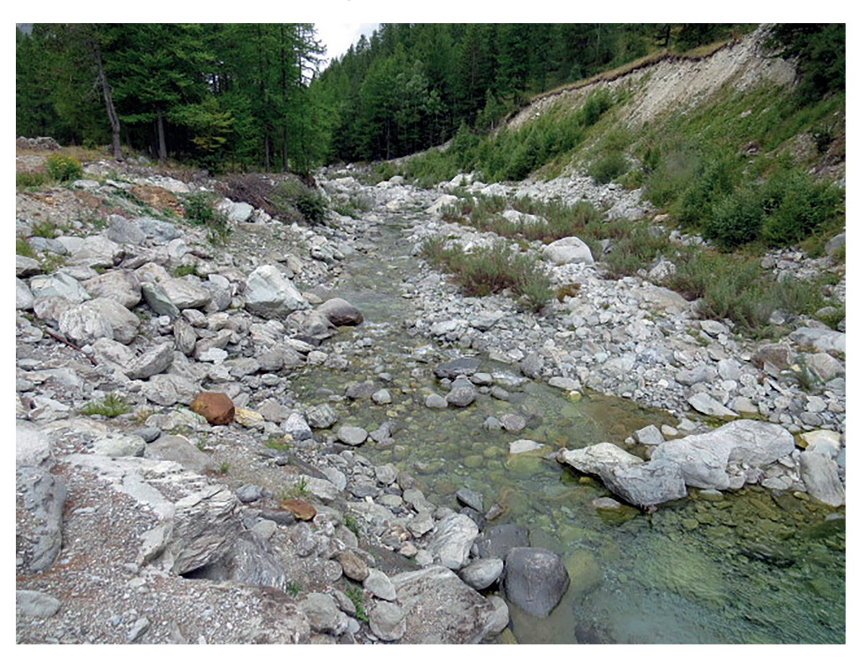
Fig. 3.1 for Question 3