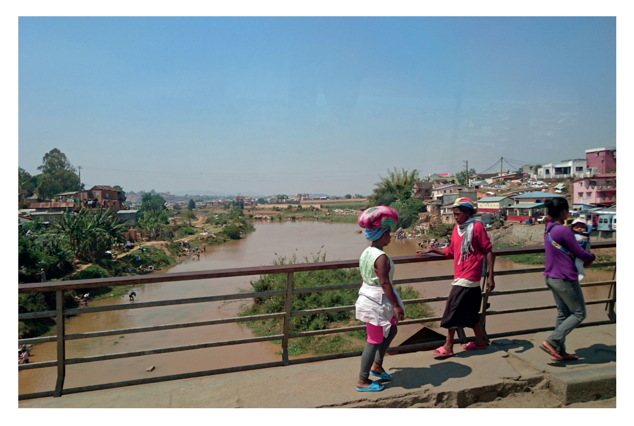
Fig. 3.2 for Question 3