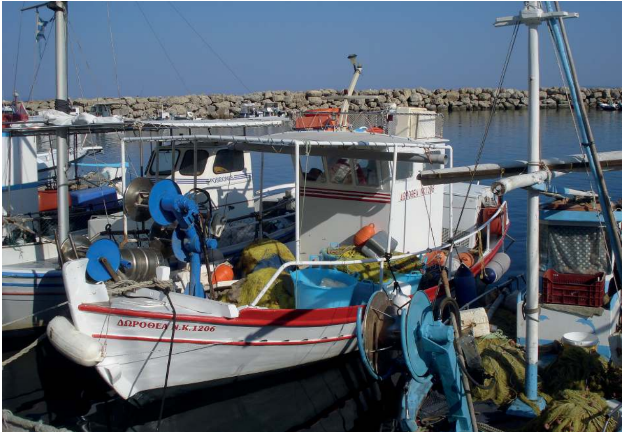
Fig. 3.2 for Question 3