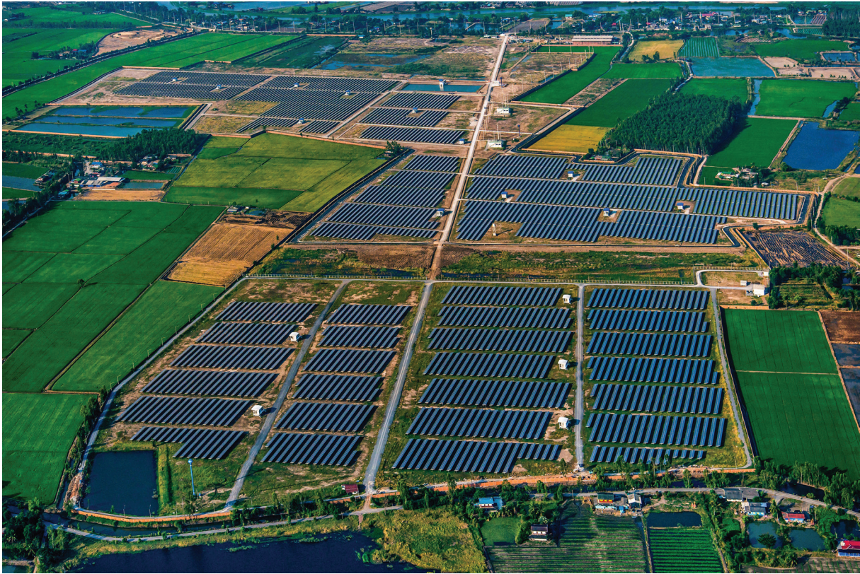
Fig. 4.3 for Question 4(c)