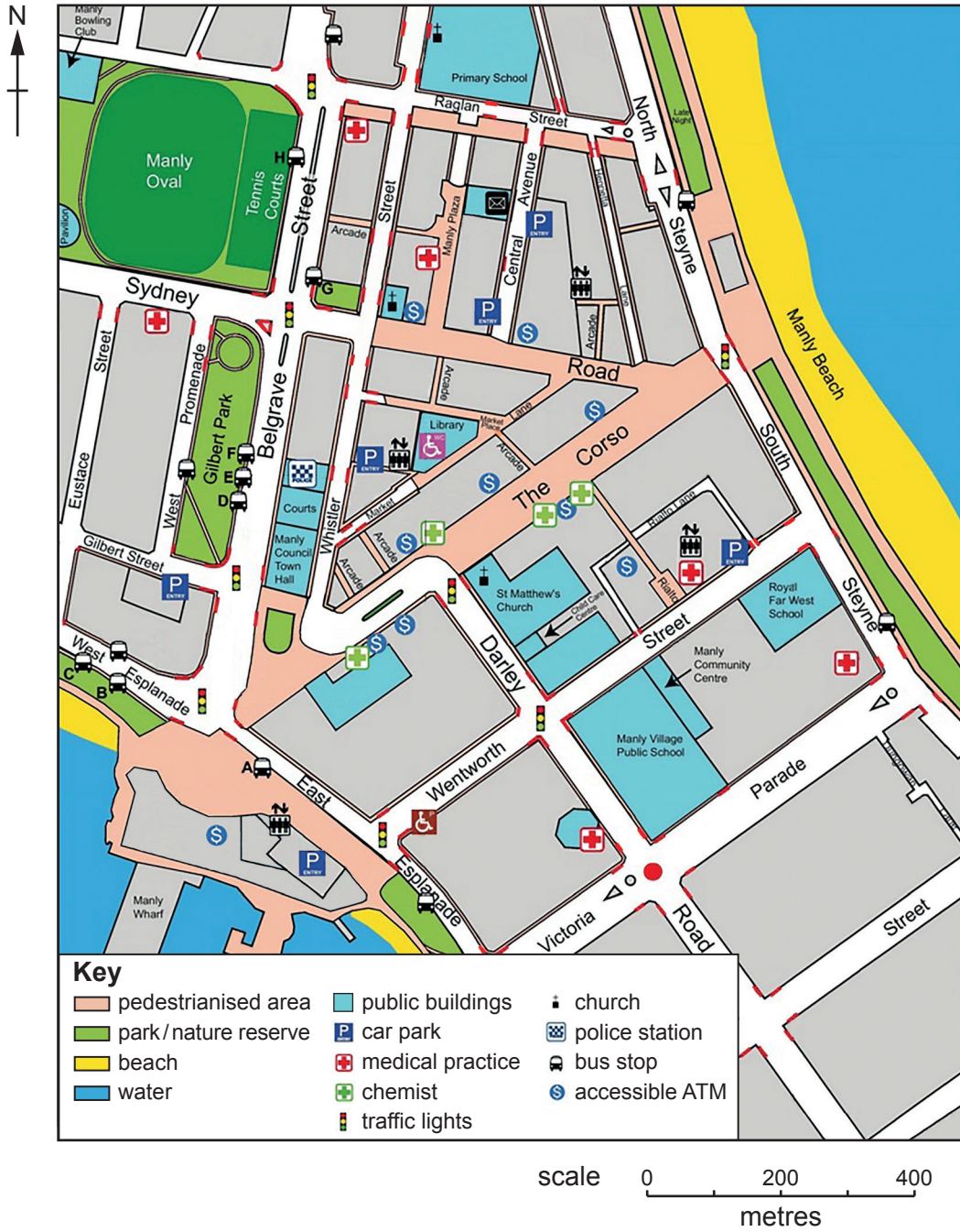
Fig. 2.1 for Question 2