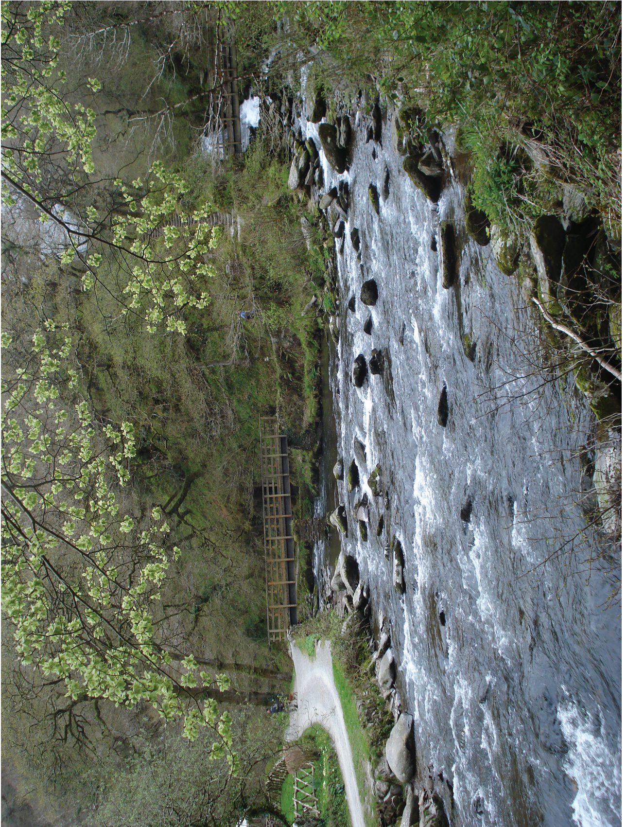
Fig. 3.1 for Question 3