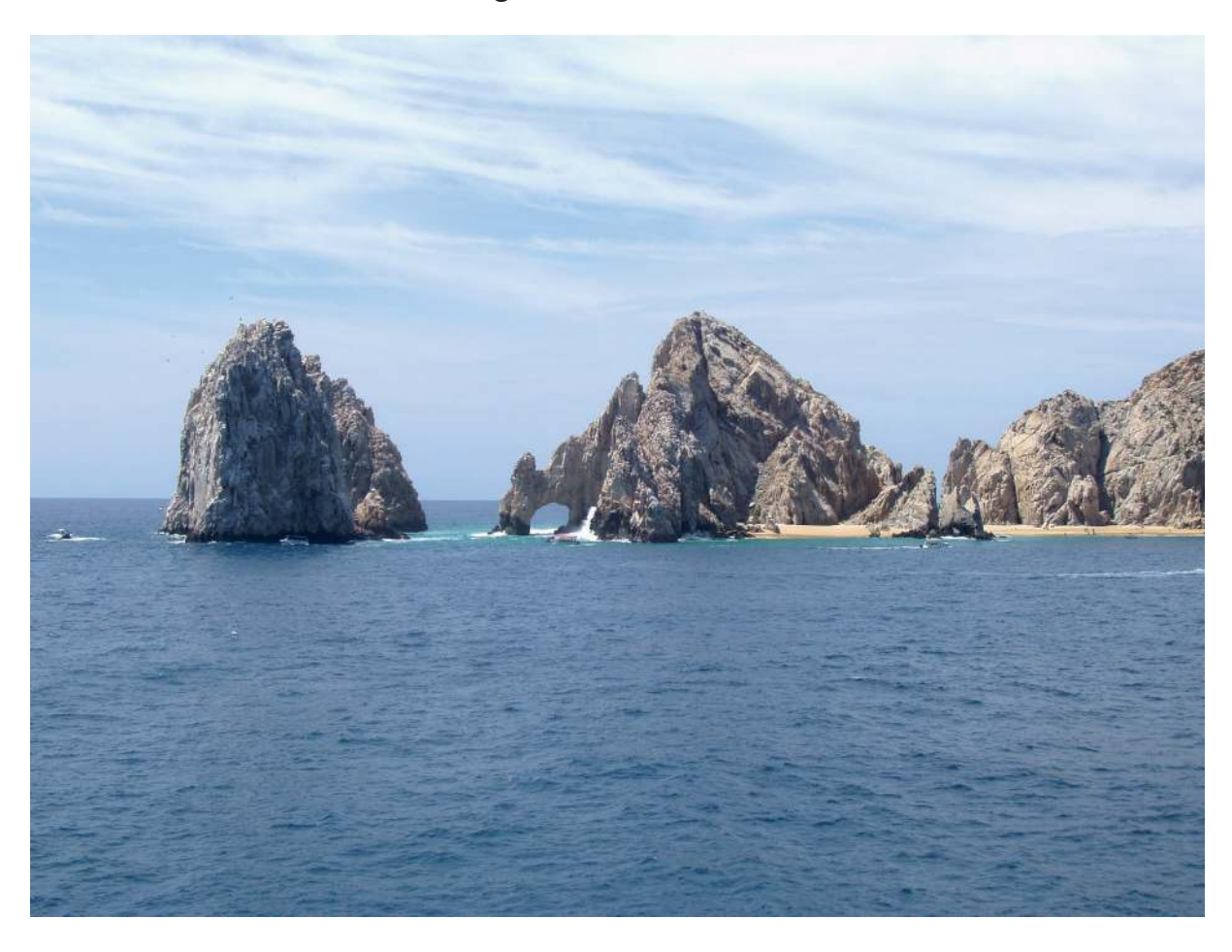
Fig. 4.1 for Question 4