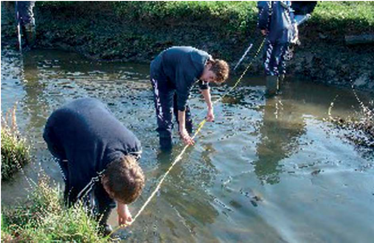
Photograph B for Question 1